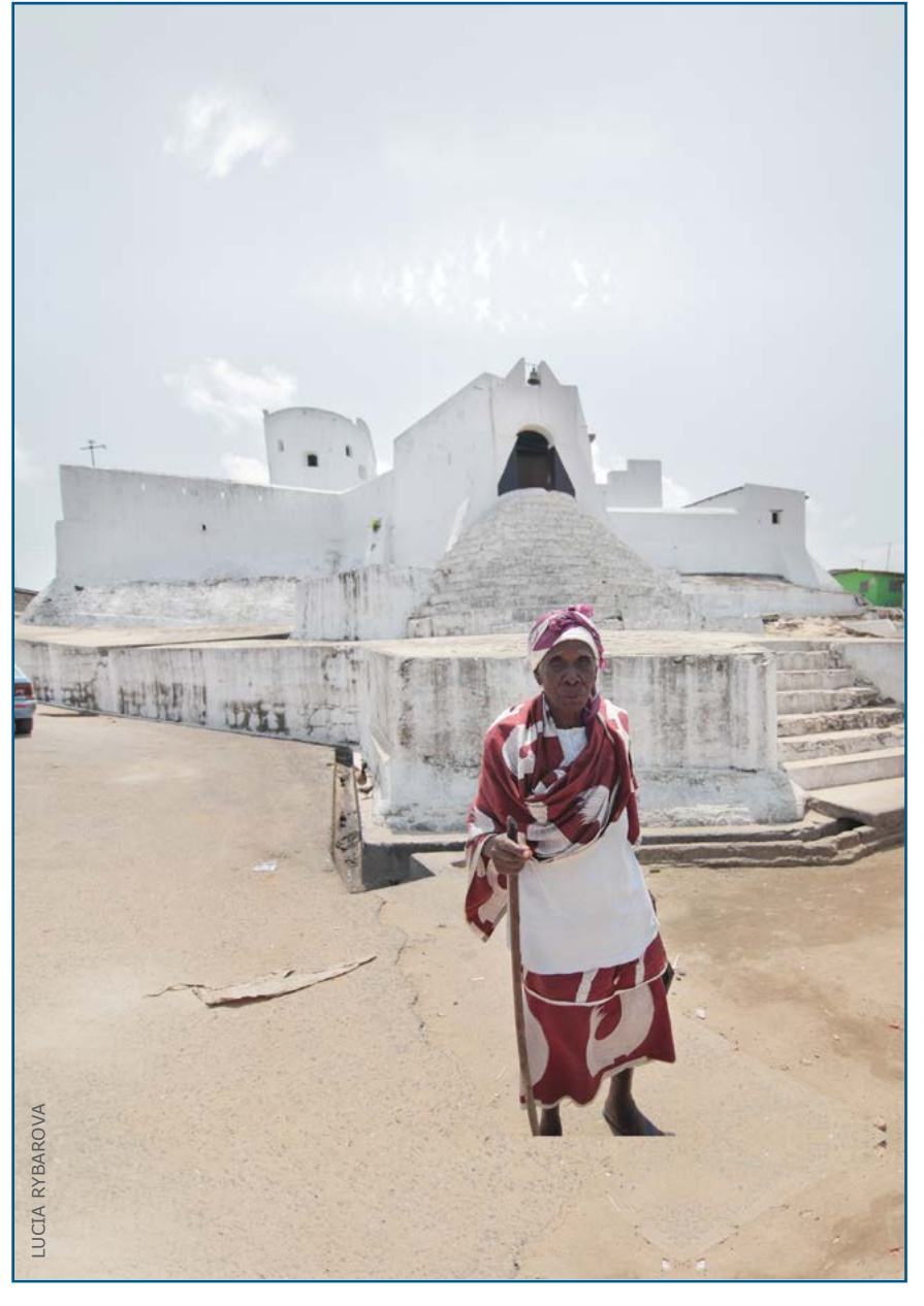
A villager in Fort San Sebastian, Shama District, Western Region of Ghana.