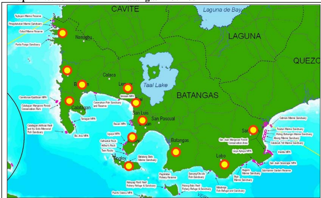
Map 1: Network of MPA in Batangas Province