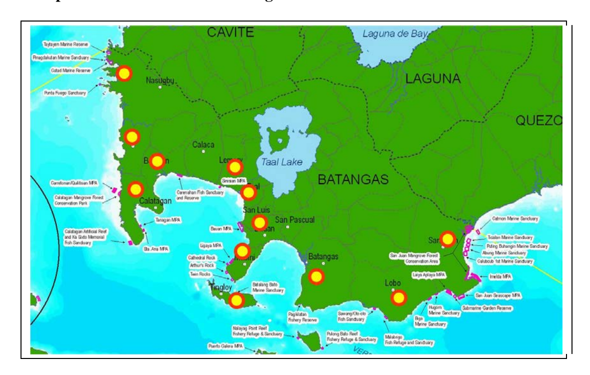
Map 1: Network of MPA in Batangas Province