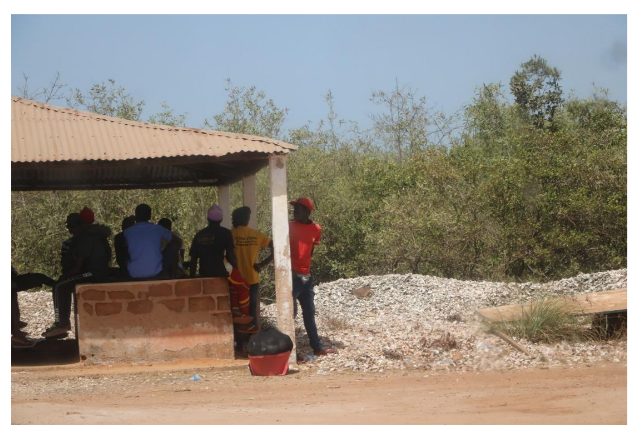
Photo A.2. Men waiting to help women in transporting their shellfishes at Cafine community.