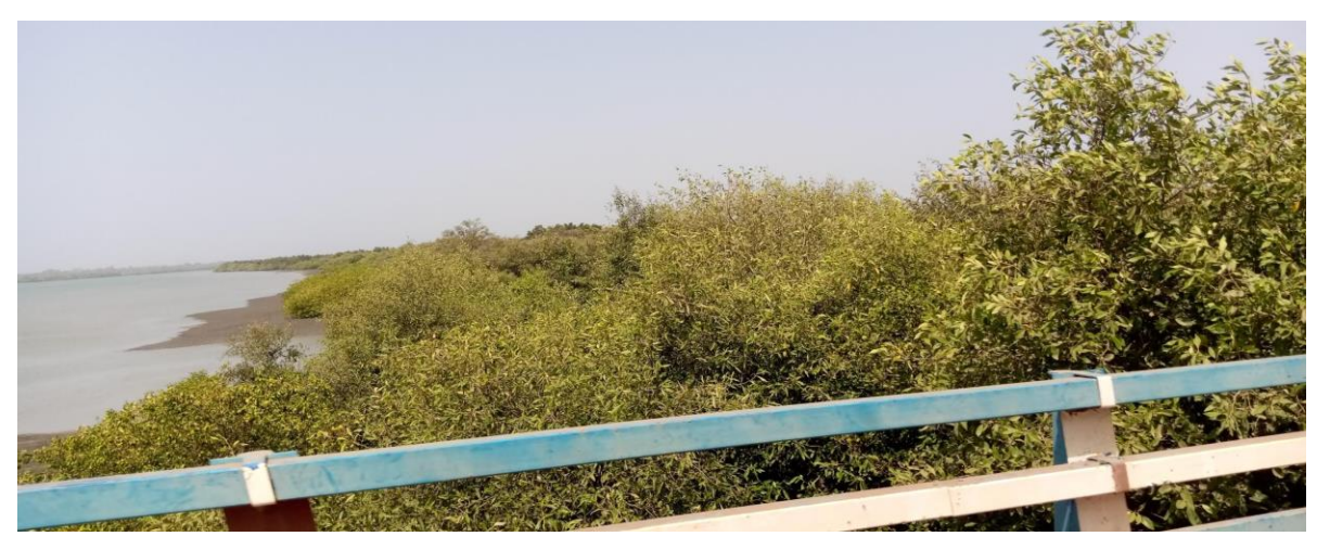
Photo A.4. Mangroves fringing shellfish a harvesting site at Cacheu community.