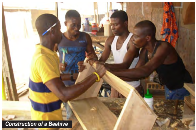
Construction of a Beehive

rather than clearing them and converting them to agricultural land. The apiaries will hopefully provide valuable honey and associated by-products that can be sold locally to meet high demand throughout the country. Thanks to project efforts with enlisted farmers, these areas are being conserved and will help maintain important stocks of sequestered carbon. A beehive was given to one promising farmer in each of four communities across the three districts. The enthusiastic farmers started practicing beekeeping at the next swarming season (which is typically late July to early November). Additionally, beehive construction training was conducted for six carpenters/artisans; three of whom were CSLP enlisted farmers. These carpenters have now gained new skill and will hopefully be engaged by additional farmers to