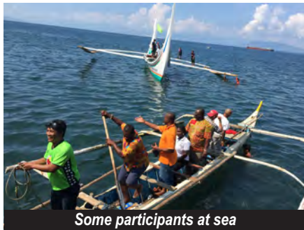
Some participants at sea