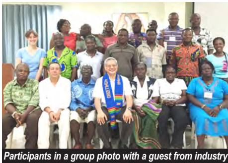
Participants in a group photo with a guest from industry

A five-day study tour to the Philippines – for 20 critical fisheries stakeholders from Ghana – has resurrected a new hope for Ghana's Fisheries management.