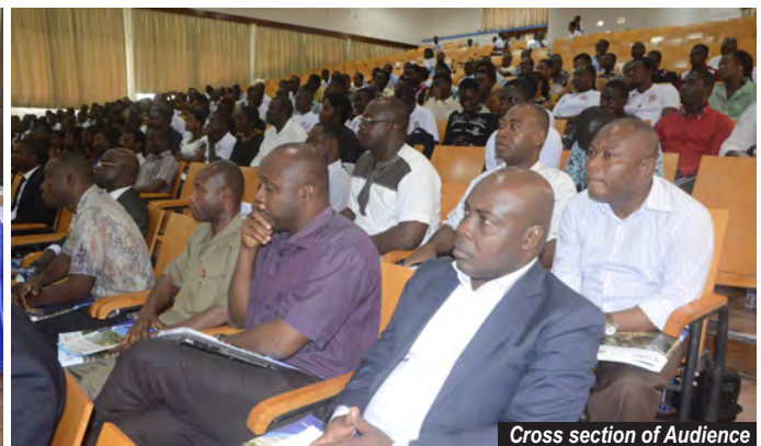
Cross section of Audience

T he Minister of Fisheries and Aquaculture Development, Hon. Sherry Ayithey has pledged govern-