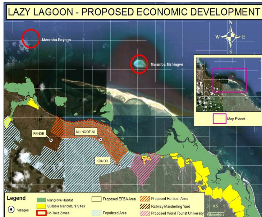
Figure 1. Map of the proposed economic development of Mbegani bay

that the writing is too scientific for our local stakeholders as a final product. Therefore, we have decided to produce a second, simplified, edition of the report that will be more appropriate for our intended users. The team has started to prepare this simplified edition.