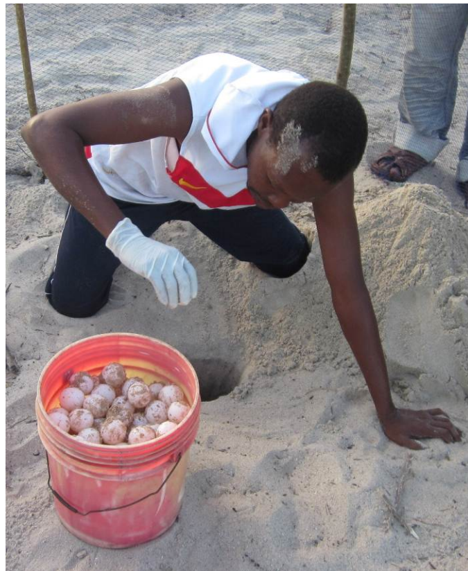
Mgaza relocating eggs from Maziwe Island

One, if not the most, important ingredient of this project is the community participation. The villagers see that protecting sea turtles is a win-win activity and that by working together they can save sea turtles from extinction. With this sort of buy-in and commitment from the community members and village leadership, we hope that they will continue protecting sea turtles for a long time to come.