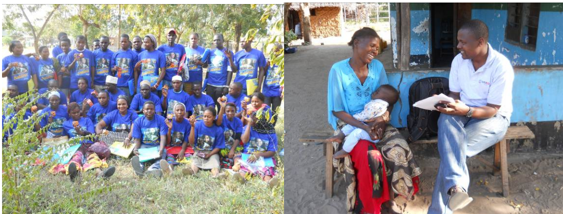
(August and September).