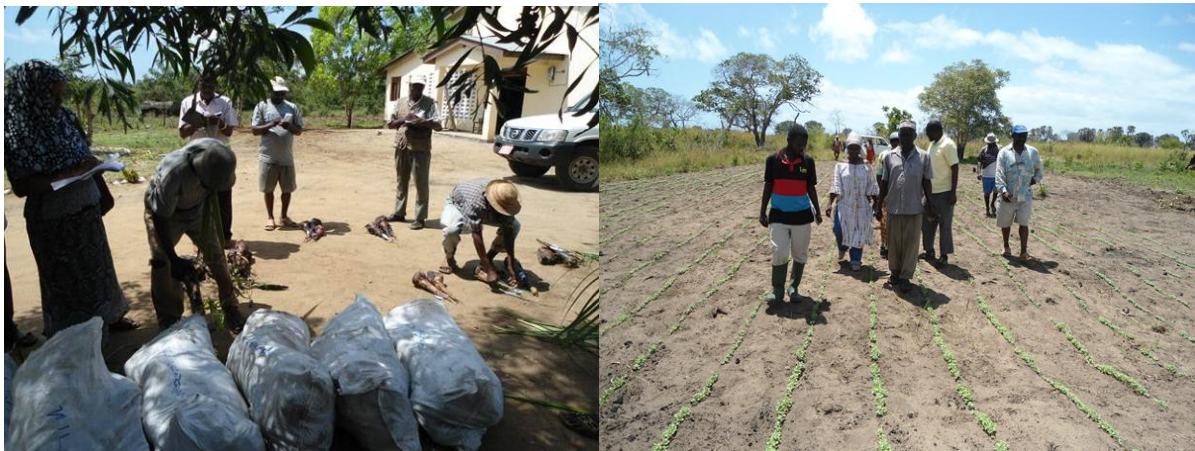
Figure 5. Photos from banana and sesame planting