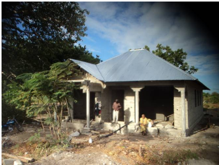
Photo of the Resource Center taken in July, 2012. The center has been more completed since then.