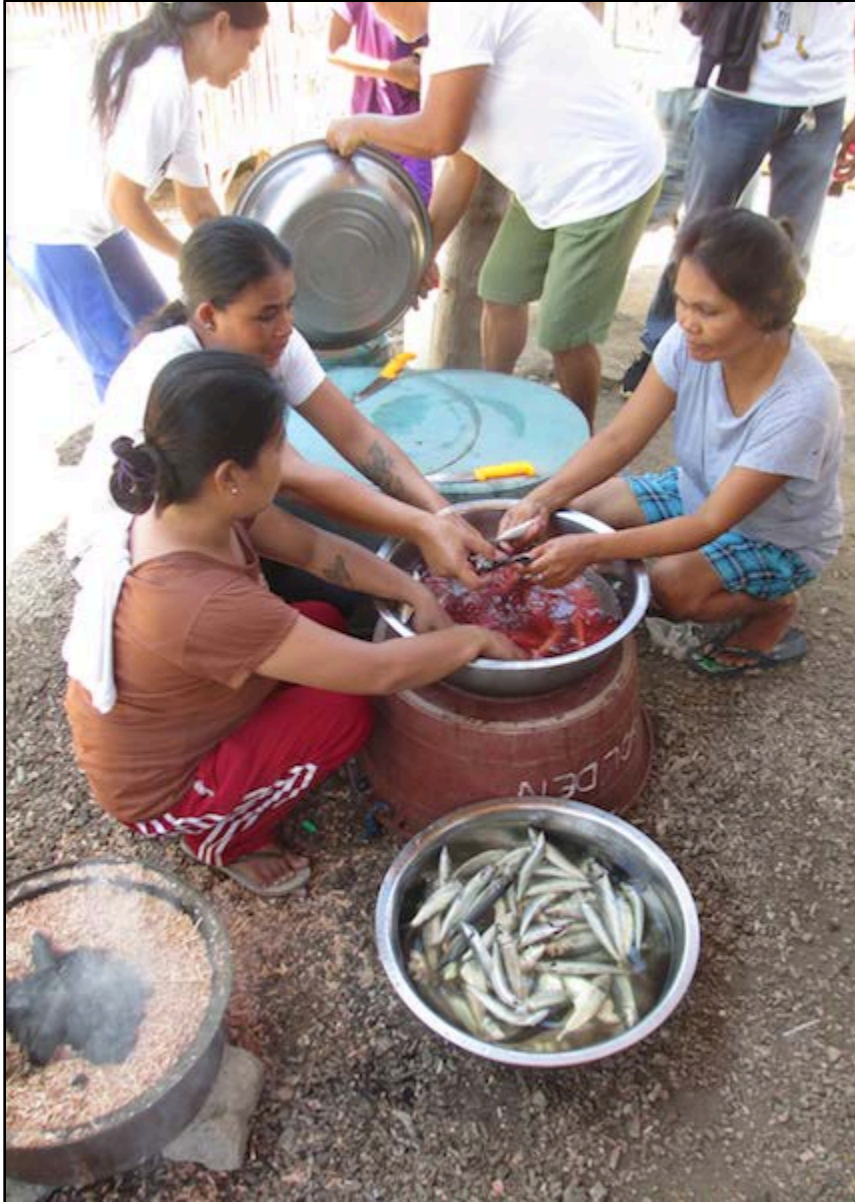
Women fish processors in the Philippines demonstrate fish smoking methods during an interaction with study tour participants.