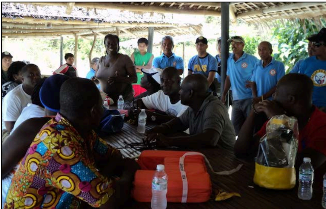
Study tour participants meet with Philippine marine police and Bantay Dagat.

Upon return to the resort, some participants received SCUBA diving and snorkelling lessons in the coral reef in Mabini, led by certified PADI instructors. These participants had the chance to experience first-hand the rich biodiversity of the Verde Island Passage.