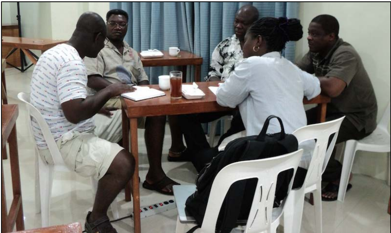
Members of the Enforcement Discussion Group meet to discuss lessons learned and possible next steps for Ghana from the study tour.