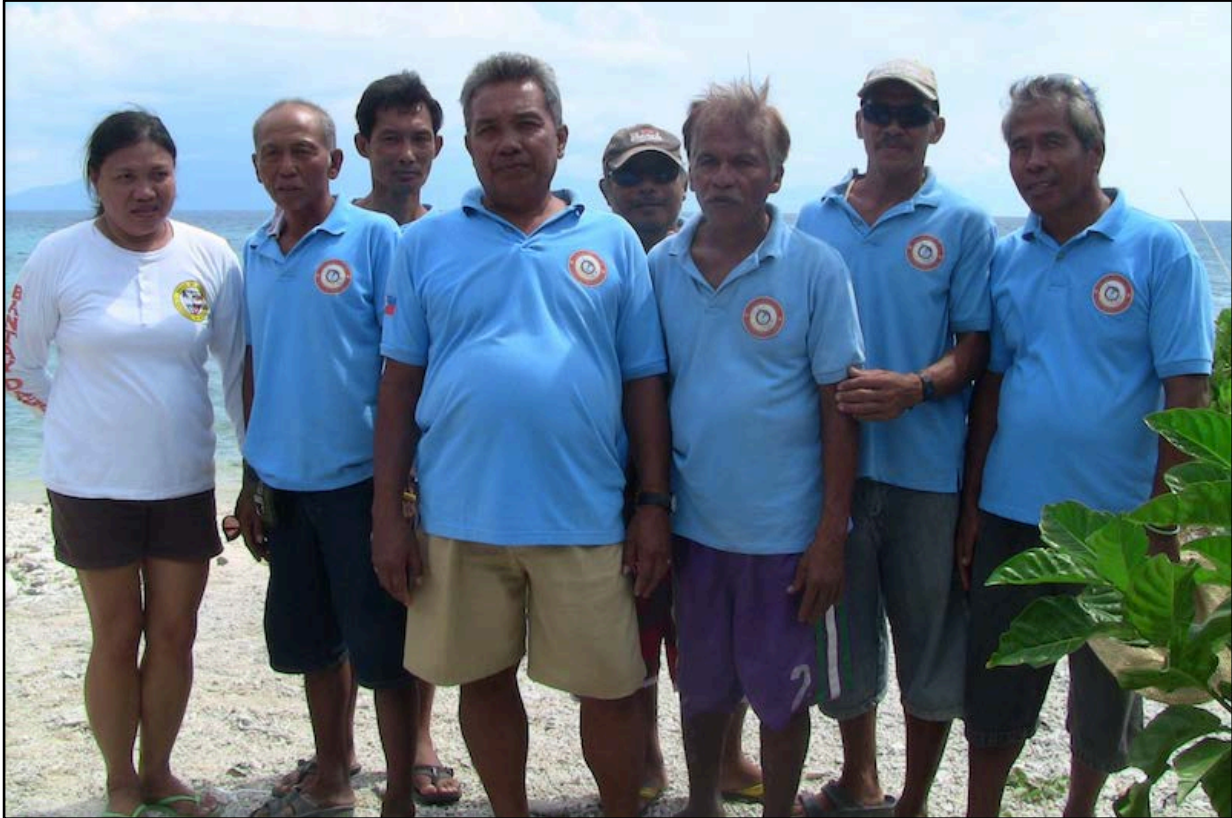
Representatives of the Bantay Dagat of the Mabini and Tingloy municipalities.