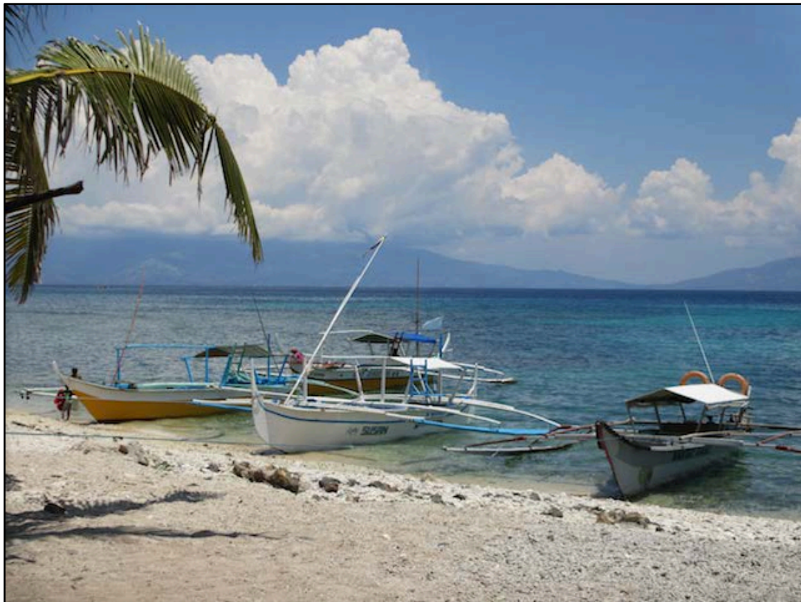
Looking out at the Verde Island Passage in Mabini, Philippines.