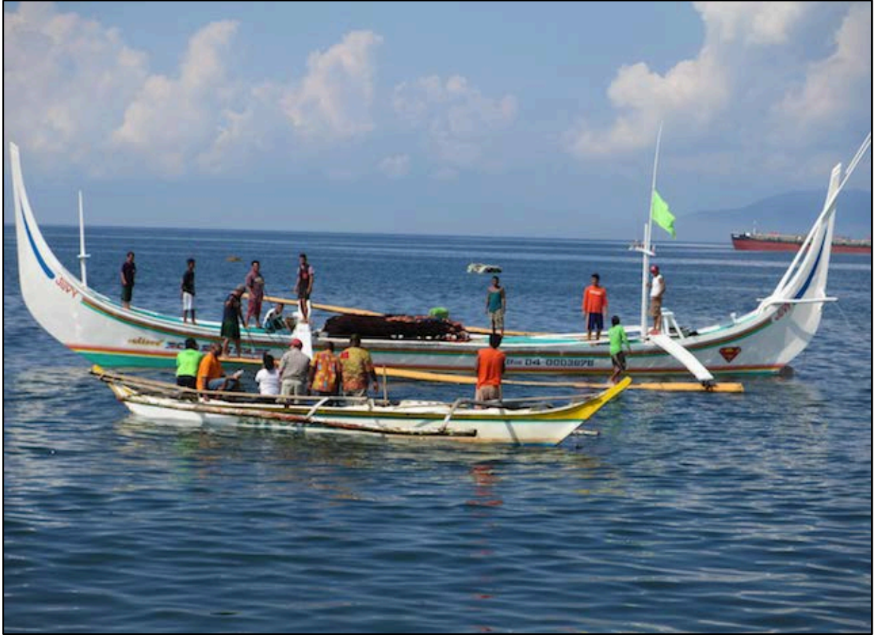
Study tour participants board a fishing vessel in the Philippines to meet the crew and inspect the gear used by local fishermen.