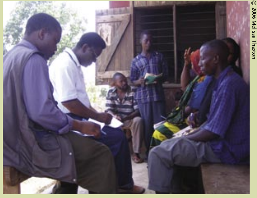
Journalists learn from local leaders how AIDS has affected natural resource management and livelihoods in their community.

The Population Reference Bureau, one of the implementing partners of the PEACE Project, conducted a four-day Population-Health-Environment training seminar for East African journalists and editors, in close collaboration with local PEACE Project staff. The training program was designed to increase knowledge, skills, and interest in reporting on population-health-environment (PHE) issues among journalists in influential news outlets, and to enhance the quality and quantity of news coverage of key PHE issues in the region.