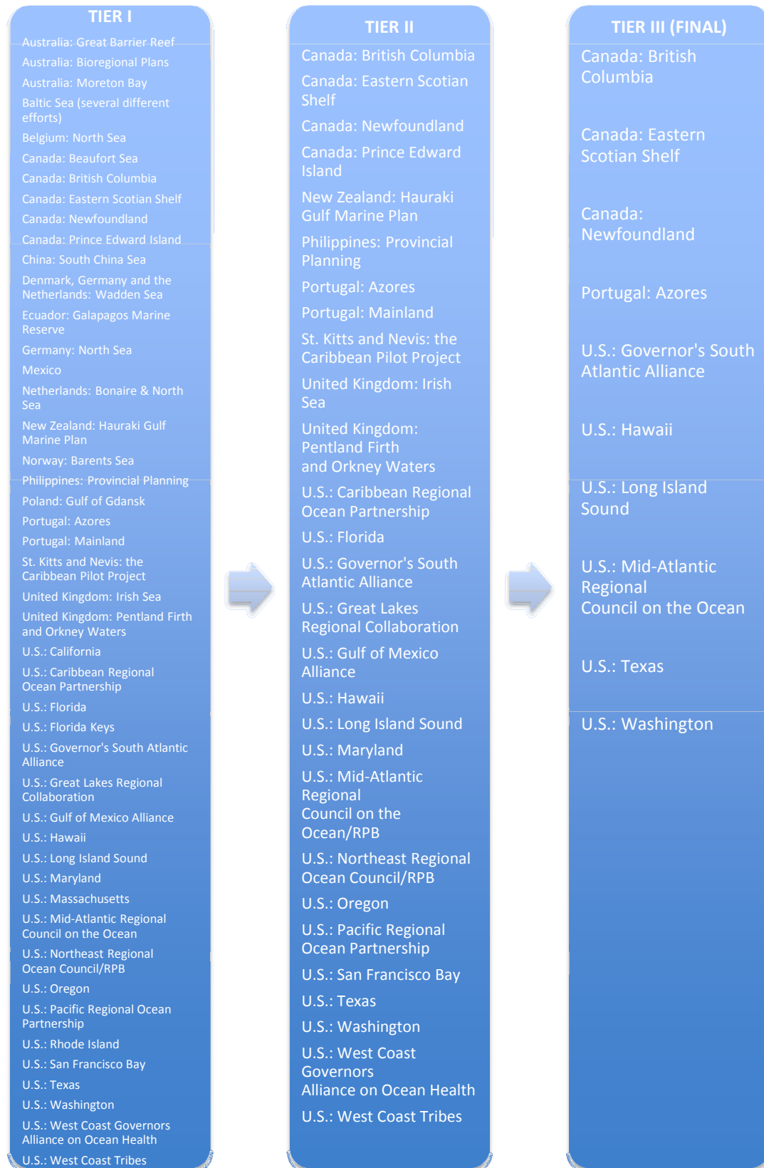
Table 2. Summary List of MSP Initiatives