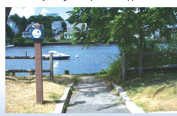
Seaview Park, Cranston

The R.I. Coastal Resources Management Council (CRMC) is supporting these efforts through the development of the Metro Bay Special Area Management Plan (SAMP). SAMPs refine the state coastal program by taking a regional, integrated approach to setting coastal management goals and policies. SAMPs are federally recognized upon state approval.