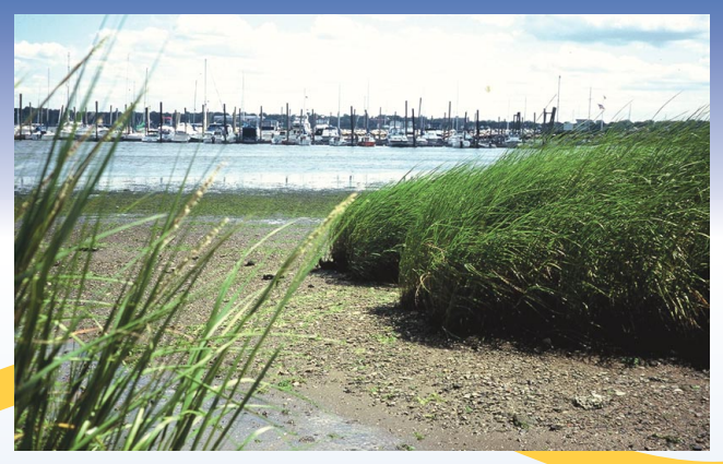
Stillhouse Cove, Cranston