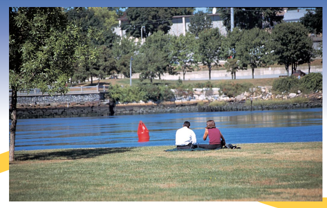
Bold Point Park, East Providence