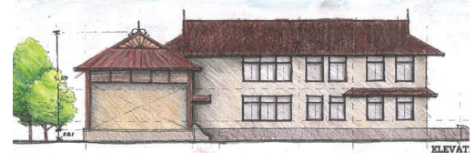
Artist Rendering of new Community/Learning Center For Suk Sumran (final plans may differ)

Ground breaking for the building is scheduled for mid-November.