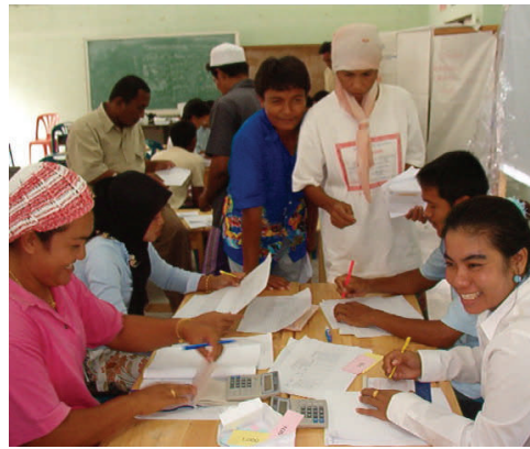
Village Revolving Fund Committee Members enjoyed practicing their accounting skills using play "money" during training provided by Suri Consult

Each village will have its own fund of 1,000,000 baht, for a total of 5,000,000 baht. Each village chose 50 people to participate in the village's fund. Priority will be given to villagers who were directly affected by the Dec. 2004 tsunami. Loan applicants will be required to prepare