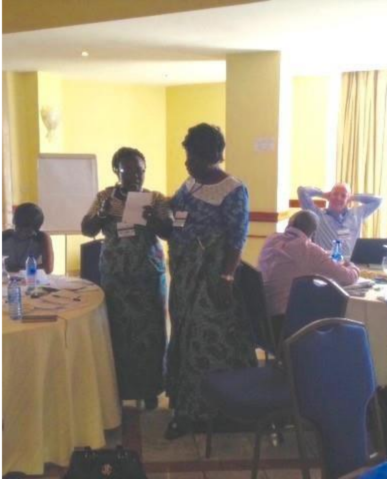
Figure 2. Introduction to product