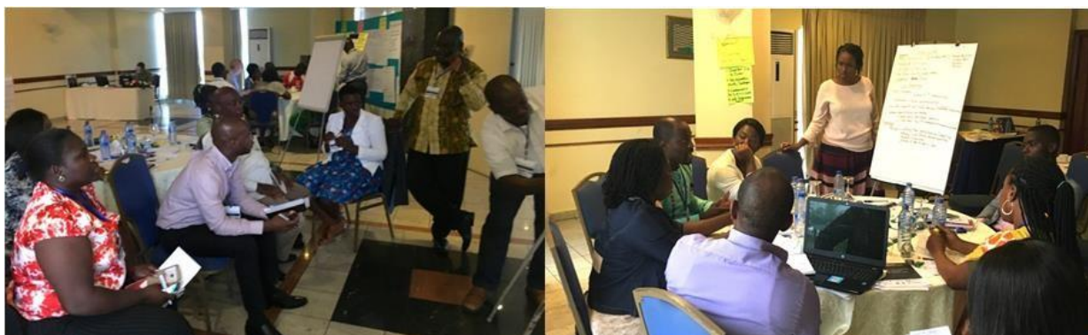
Figure 5. Western Region presentation