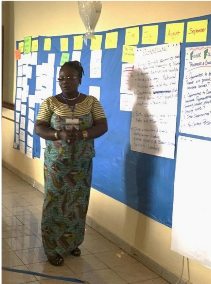
Figure 3. Group 1 presentation