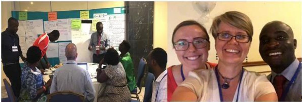
Figure 6. Greater Accra Region: Jamestown presentation