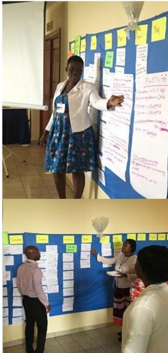
Figure 4. Group 2 presentation