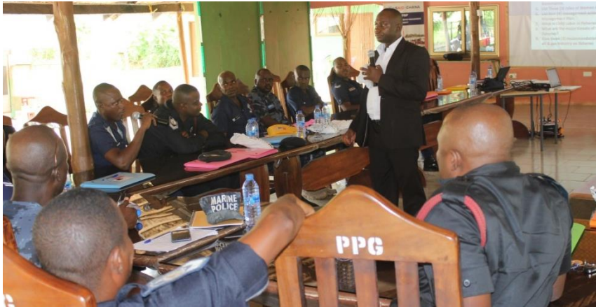
Figure 4. Marine Police Officers participating in one of the training courses.