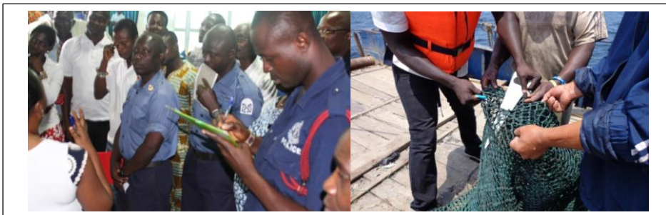
Figure 3. Fields exercises and stakeholder interactions.

To pass the induction program and be placed with a MPU post the Officer must achieve a passing score on the competencies. MPU needs to establish the passing score, such as a 60% in every category with an overall score over 70%. This ensures that each Officer has a broad breadth of competencies yet room for improvement while on the job. For Officers who do not meet the passing score, they could be placed on a probation period in which they need to work with their supervisor to achieve competence standard within the first six months on the job. There is also the option to set a non-passing grade of below 60% or similar in which the Officer must enter a remediation training program before joining the MPU due to a lack of sufficient competence. MPU will need to work out the policy in advance with Ghana Human Resources to ensure a fair policy with options for redress.