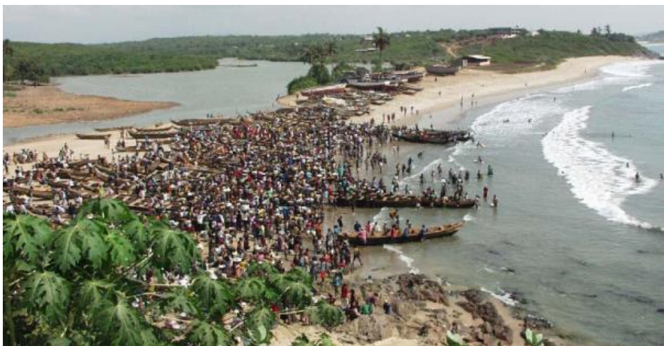
Figure 5. A local fishing landing site in Ghana used for simulations.

The Ayinase Training Center has been furnished for the purposes of conducting the Induction Course for MPU Officers. The center has a dedicated training room that allows for projector presentations and interactive group activities. Access to nearby fishing landing site and ports is also a necessary requirement for field and practical exercises including swimming, vessel inspections and boat patrols (Figure 5).