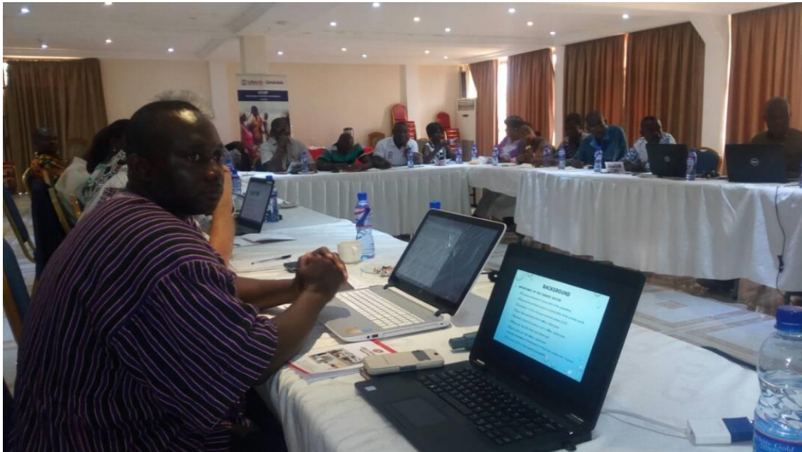
Figure 1. A picture of cross-section of participants at the meeting

Representatives for the University of Cape Coast and the University of Rhode Island were also present at the meeting.