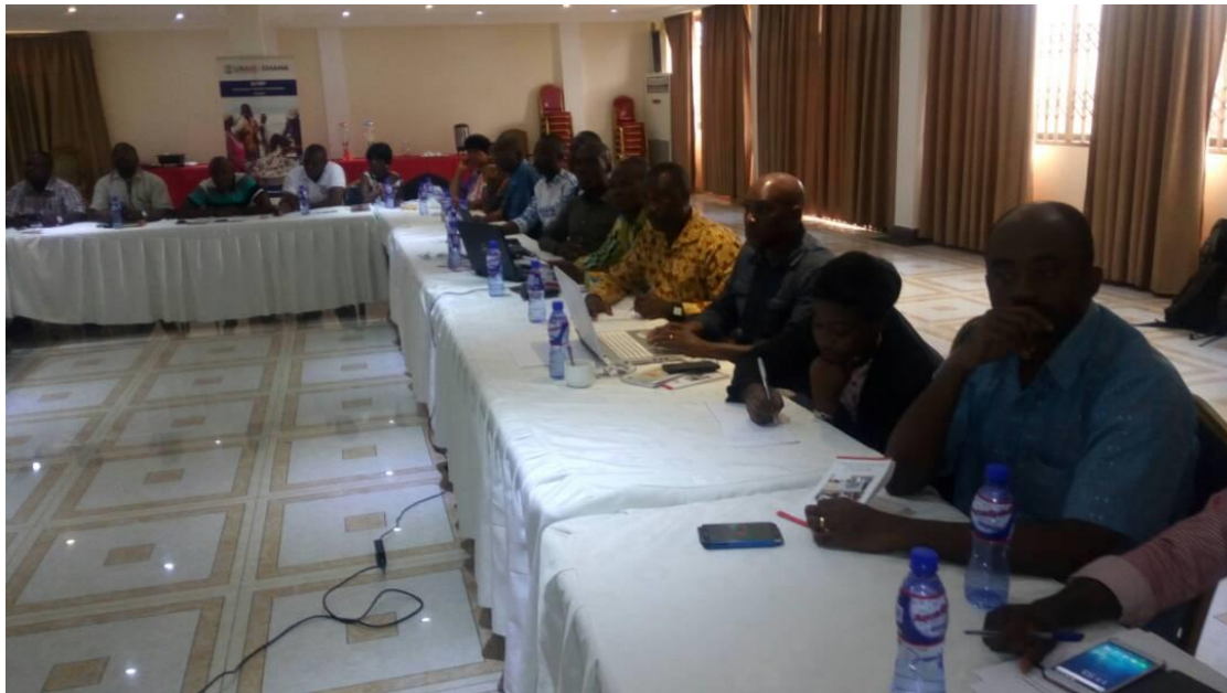
Figure 4. Pictures of participants at the action planning session