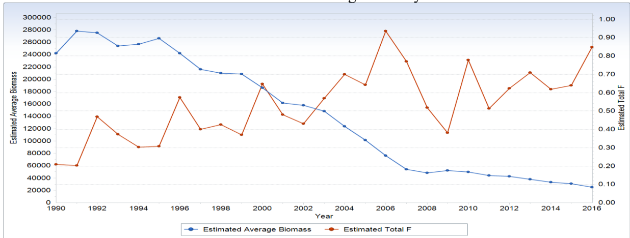
Figure 6. A graph showing the stock status of small pelagics fish stock in Ghana.