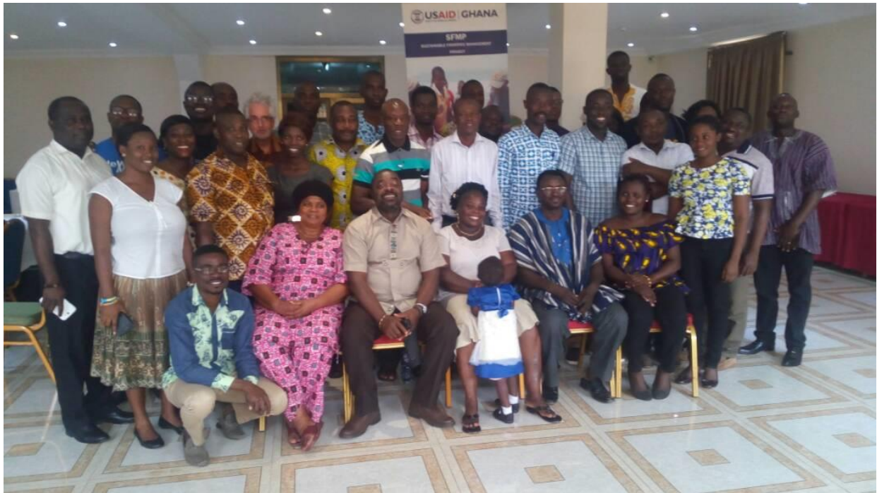
Figure 2. Group picture of participants

The meeting concluded with an action plan that outlined additional interventions that Civil Society Organizations and the media could undertake to support the implementation of the NFMP to contribute to sustainable fisheries management in Ghana.