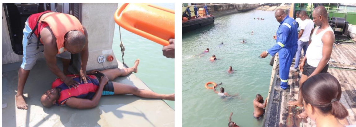
Figure 7 Marine police officers practicing new skills on rescue swimming at Takoradi Harbor

In a separate but parallel initiative, SFMP continues to work with the Marine Police Unit of the Ghana Police Service to strengthen their capacities on Fisheries Laws and Regulations through a competence-based capacity development and training program. The objective of this program is to promote competence-based fisheries enforcement deterrence through trained and prepared voluntary enforcement teams that can apply knowledge, skills and the right attitude (KSA) in fisheries enforcement.