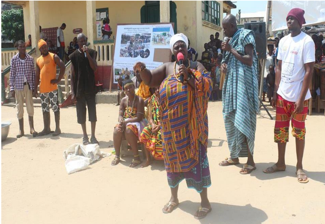
Figure 12 A scene of drama performance on child labor at the National Farmers Day Fisheries Child Labor Policy Socialization Engagement Meetings with District Assemblies Child Protection Panels/Committees

SFMP began activities to assist the national government to socialize its National Fisheries Child Labor Policy document which previously had not been socialized with the social welfare officials or the stakeholders at the district and regional level. SFMP organized five (5) separate meetings for the district child protection panel members and anti-CLaT advocate from the ten (10) coastal districts in the Central Region. In all, 198 participants (124 males and 74 females) were engaged to increase awareness of the policy document. Participants included the Ghana National Canoe Fishermen’s Council (GNCFC), Ghana Police Service, National Fish Processors and Traders’ Association (NAFPPTA), the Ghana Immigration Service, Department of Social Welfare, District Planning and Coordinating Unit, Ghana Information Service Division, Fisheries Commission, District Child Protection Committees and Community Anti-CLaT advocates. Discussions at the meetings promoted participants’ appreciation of child labor issues and stakeholder roles to reduce CLaT practices.