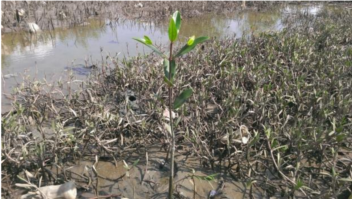
Figure 10 Mangroves planted during the 1st phase of the restoration process in April 2017 at Densu estuary at Tsokomey in the Ga South Municipality