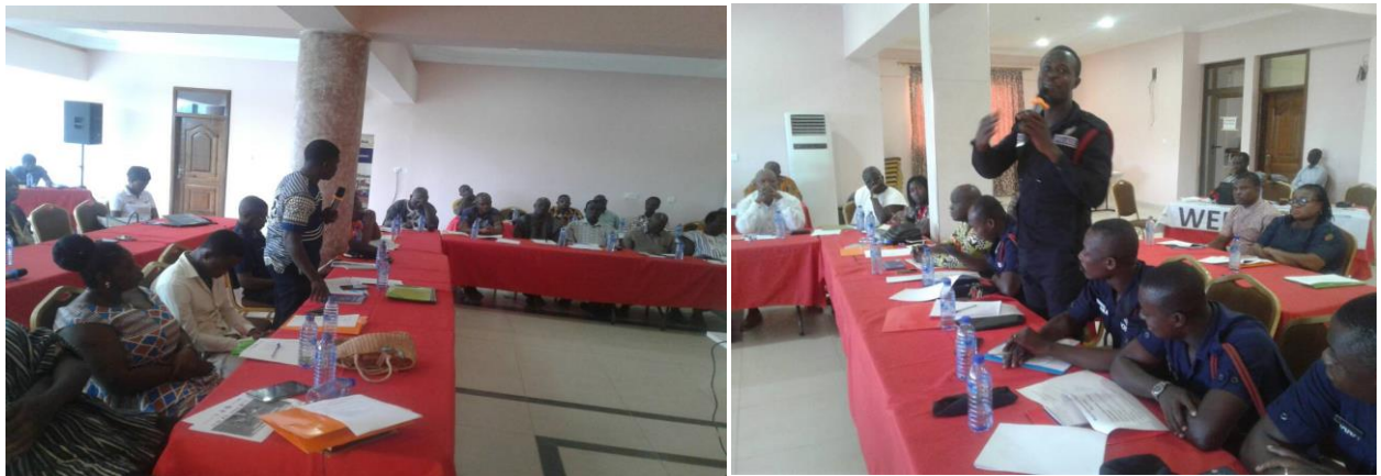
Figure 6 Fisheries Working Group Meeting at Central (left) and Volta (right) regions

At both meetings the Fisheries Commission committed to providing electronic & hard copies of the canoe registration data to the FEU and the coastal district assemblies to support enforcement. Participants recommended improved engagement on the NFMP by increasing direct stakeholder participation in the implementation process.