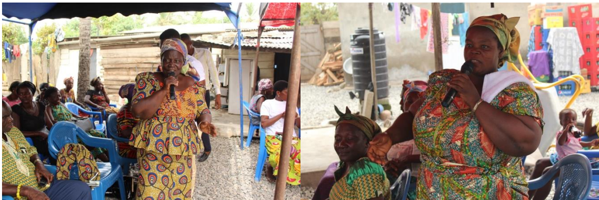
Figure 5 Fish processors sharing experiences on SFMP hygienic fish handling training at Tsokomey in the Ga South District

Continuing SFMP's focus on peer-to-peer learning and information exchange among fisherfolk and other community members, especially those engaged in fish processing, SFMP conducted its quarterly review meeting with local fisherfolk on December 12, 2017 at the interim DAA Fisheries Training Center at Tsokomey in the Greater Accra Region. The meeting focused on successes in behavioral change during the first three years of SFMP implementation process and how these successes inform action in the final two years of the project. Many of the 75 participants (85% women) expressed their appreciation for the knowledge, capacity building and leadership skills learned through the three years of SFMP support. The participants shared their experiences on how healthy and hygienic fish handling training has helped to improve their fish processing businesses.