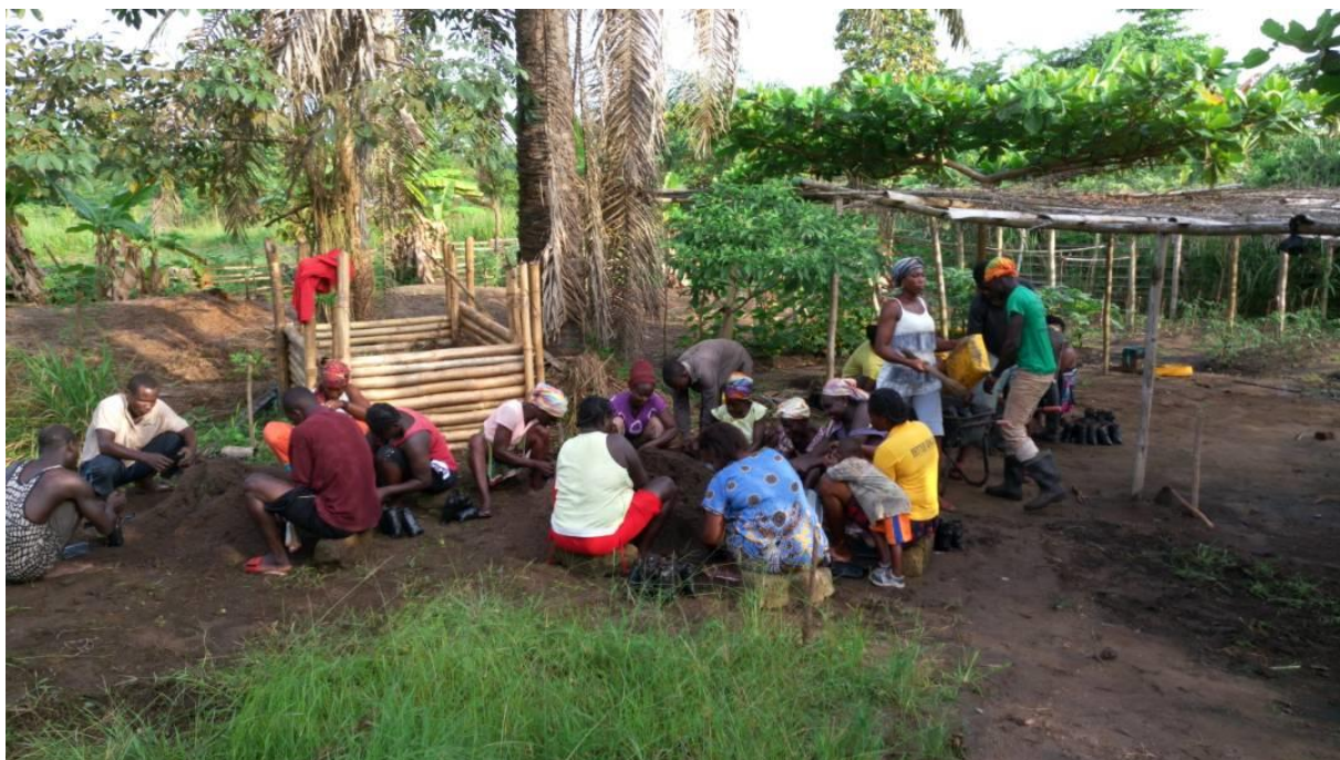
Figure 8 Community folks filling poly pot with soil and mangrove seeds at Ankobra nursery site in the Western Region

As part of actions to ensure a healthy Ankobra estuarine fishery, a mangrove nursery site was prepared to enable raising of high quality mangrove seedlings for re-planting in degraded areas during Year 4. About 20,000 ‘poly-pots’ for nursing seedlings were procured, 16,200 of these poly-pots were filled with soil and 3,000 planted with mangrove propagules (seedlings). Mangrove nursery site preparations and management were carried out by community inhabitants and have consequently increased community-wide knowledge and practical actions to protect mangrove ecosystems such as demarcating and maintaining buffers areas along the river stretch where mangrove harvesting is currently prohibited.