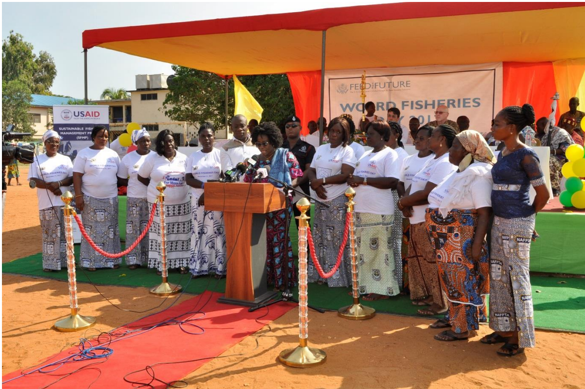
Figure 2 Minister for Fisheries and Aquaculture Development, Elizabeth Afoley Quaye, delivering her address at the 2017 World Fisheries Day in Keta, Ghana surrounded by members of the National Fish Processors and Traders Association.

and Jubilee FM to align with the event and increase public awareness about the various challenges confronting Ghana's coastal fisheries.