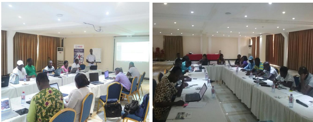
Figure 1 Fisheries Commission's zonal officers participating in GIS training in Accra.

GIS technology has revolutionized geographic analysis in fisheries resources management in many countries although using GIS for collecting, analyzing and managing data in Ghana's fisheries sector is still evolving. During this quarter, SFMP worked with implementing partners to train 16 Fisheries Commission zonal officers (6 females and 10 males) selected from all four coastal regions in the application of GIS for fisheries data management. Training sections included utilizing GIS software QGIS and Google Earth Pro mobile mobile applications for spatial data analysis. These officers are now able to collect and process fisheries-related data with mobile GPS devices, conduct basic GIS-based analyses with fisheries data, and produce customized maps with new and previously existing data.