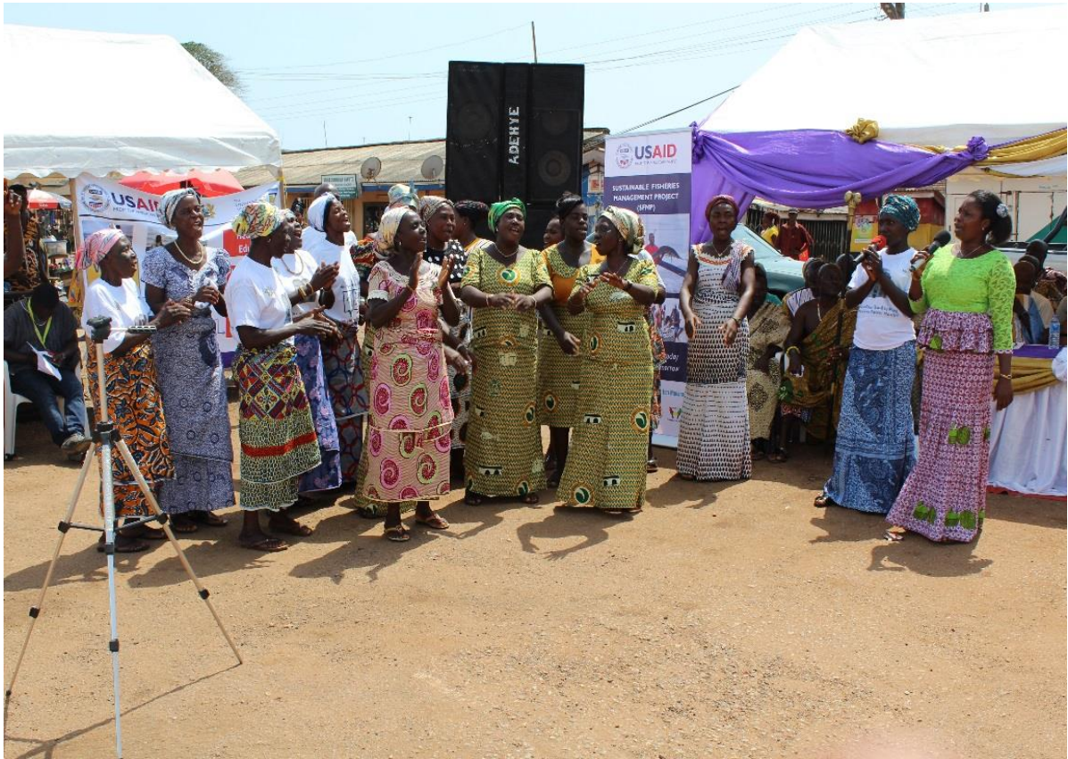
Figure 4 Celebrants dancing to commemorate International Day for Rural Women at Mumford, Central Region