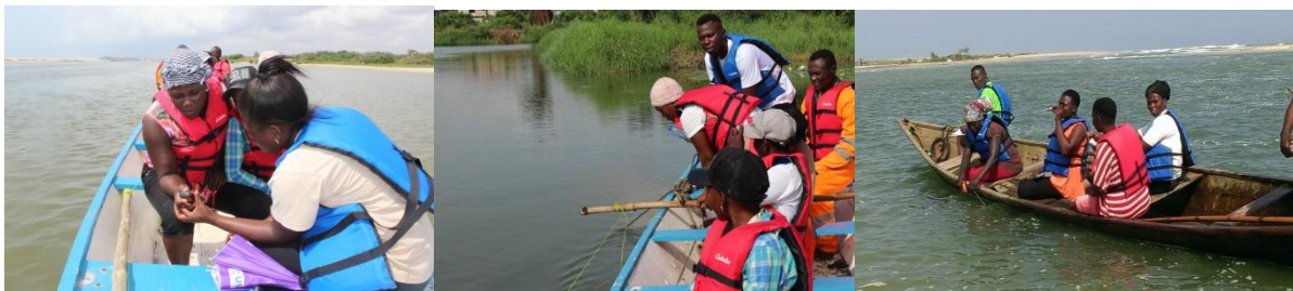
Figure 11 Trained oyster pickers collecting data on water quality from the Densu estuary at Tsokomey

improve oyster growth. Thirty community oyster pickers received training in Year 3 in oyster ecology and biology were selected to learn how to collect and understand water quality data collection including water salinity (surface and bottom), turbidity, and pH. Data now has been collected for six months and women are beginning to understand the cycles of water quality that affect oyster growth. The next step is for the women to use their knowledge to identify areas that experience lower water quality fluctuations and make plans to seed these areas with new oysters under the final Densu Community Co-Management Plan.