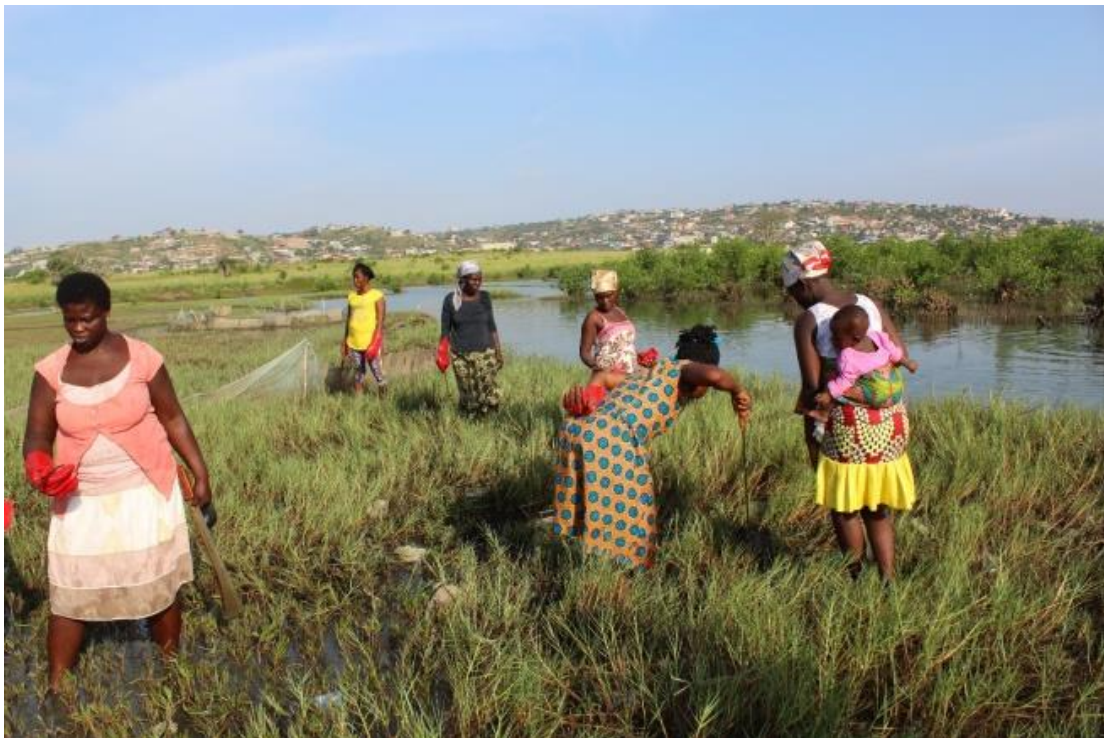
Figure 9 Members of Densu Oyster Pickers Association planting mangroves around Densu estuary at Tsokomey in the Ga South Municipality

The loss of mangrove cover throughout the Densu Delta (an international RAMSAR protected area) in the Ga South district of Ghana is caused by clearing of the mangroves as source of fuel wood for domestic cooking and fish processing. This loss has impacted on soil and water quality. In order to address these challenges, SFMP established a mangrove plantation as part of its pilot Community-Based Management Plan for the Densu estuary, with oyster as the fishery resource. This was led by the Densu Oyster Pickers Association (DOPA) in Tsokomey, Tetegu and Faana. The women oyster pickers embarked on the 2 nd phase of mangrove restoration on November 21, 2017 by planting 1,500 mangrove seedlings. A total of 76 community people (11 males) embarked on the mangrove planting exercise.