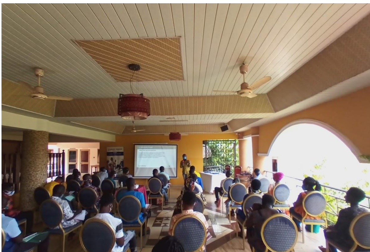
Figure 2 The Western region training workshop in session