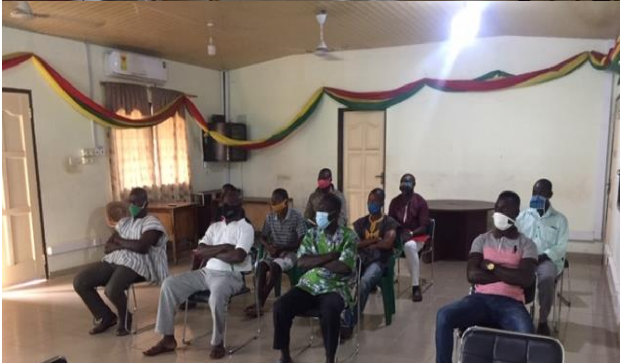
Figure 1 A cross section of participants at the Ada East, Ada West (top) and Ningo-Prampram districts (bottom) training workshop.