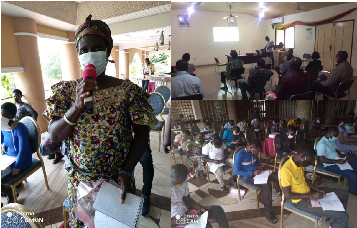
Figure 4 Community Site Advocates participating in the different training activities.

Participants were engaged on the EngageSpark telephone reporting/monitoring protocols, an intervention provided by Bob Bowen and Ted Donovan from CRC. Finally, the participants were provided with hard copies of the project reporting template which they will fill on weekly basis and submitted to Hen Mpoano/SFMP.