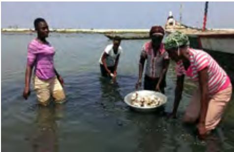
Women harvesting oysters at Tsokomey

150 community members have benefitted from a leadership training in the co-management of oyster resources.