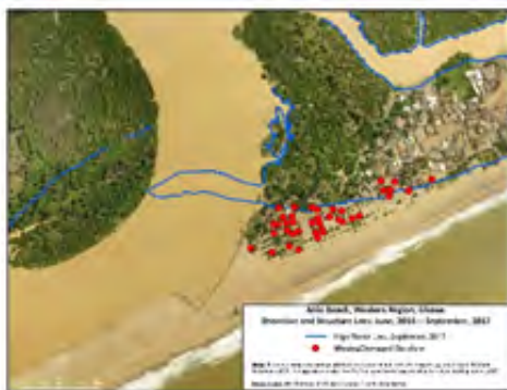
An aerial view of Anlo Beach with analysis that shows the impact of erosion.

SFMP trains local researchers to use unmanned aerial vehicles for identifying and mapping coastal communities in the path of floods and erosion.