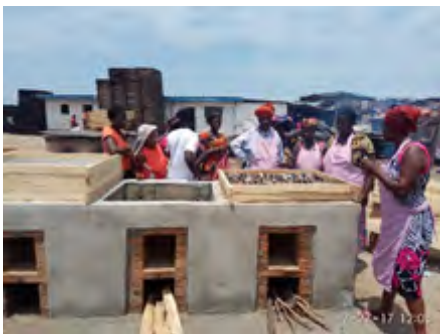
Fish processors experiencing the benefits of the 'Ahotor Oven'

110 fuel-efficient and profitable fish-smoking ovens called 'Ahotor' have been constructed across the nation's coastal regions.