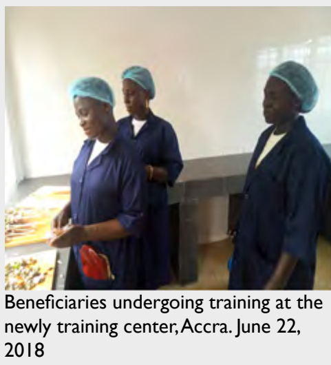
Beneficiaries undergoing training at the newly training center, Accra. June 22, 2018

or DAA, has been operating out of a small one-room office with limited ability to train large numbers of women fish processors across Ghana’s fishing communities. This new training center now provides a facility that now can do just that. The majority of women fish processors in Ghana’s artisanal fisheries sector lack the capacity and skills to improve their businesses. This makes it difficult for most of them improve their livelihoods and hampers economic growth.