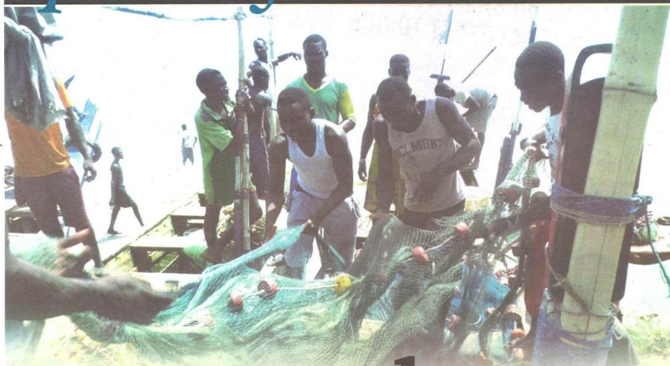
• Returning from sea with almost empty nets