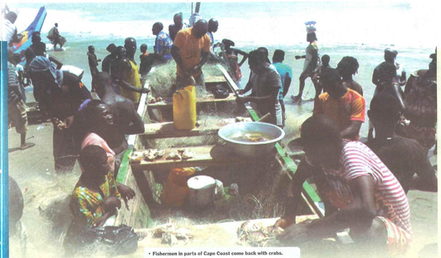
• Fishermen in parts of Cape Coast come back with crabs.

Statistics from the Fisheries Commission indicate that annual sardinella or herring catch has plunged continuously, while the number of artisanal fishing canoes rose to more than 13,000 in 2014.