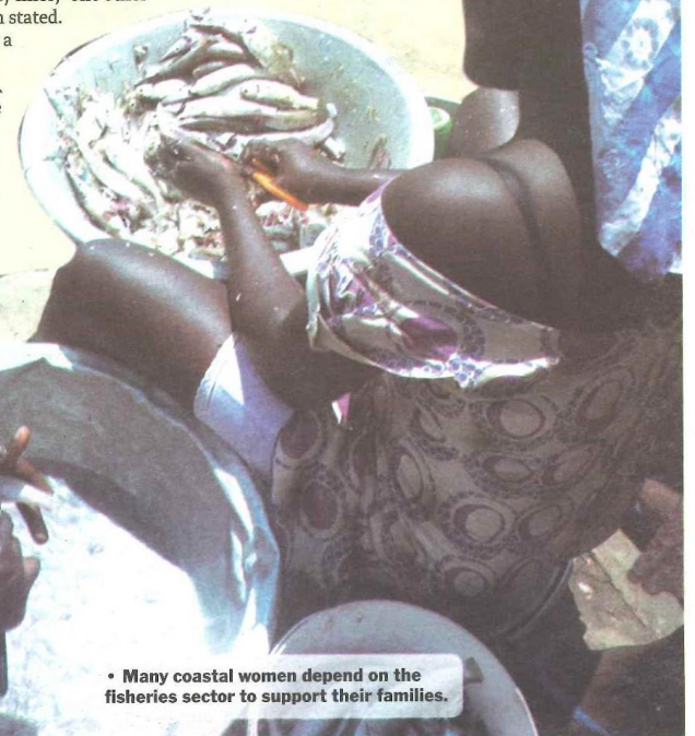
• Many coastal women depend on the fisheries sector to support their families.

The fight to restore the fisheries sector must be won. We cannot, as a country, afford to lose this war.