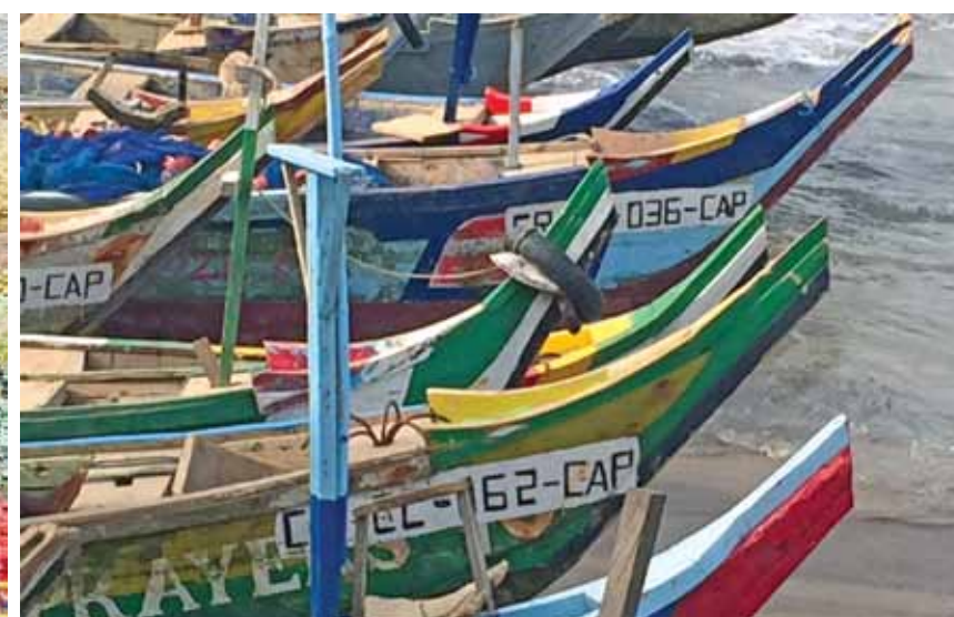
Ghana fishing community, nets and boats