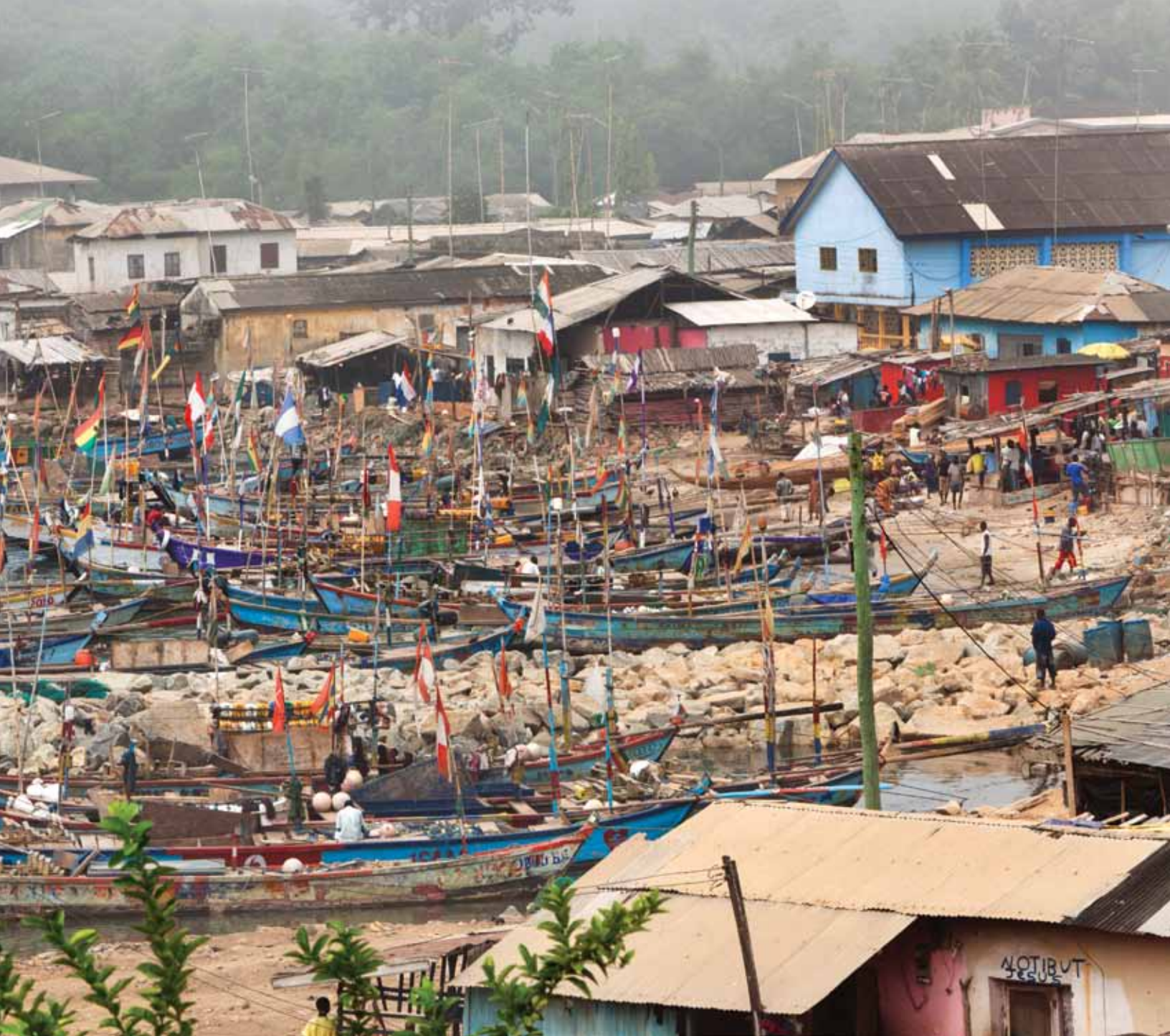
Ghana fishing community