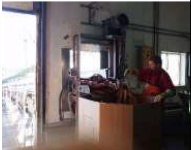
working on their boat, observe offloading and receiving of product.

Port of Pt Judith Port agent. The tour provided the participants with an overall view of the fishing industry in Rhode Island from small through large vessels. It also highlighted the port facilities. Participants were impressed with the ability to recycle oil and old gear, as well as the receiving facilities (ice, and storage). They were able to have conversations with fishermen