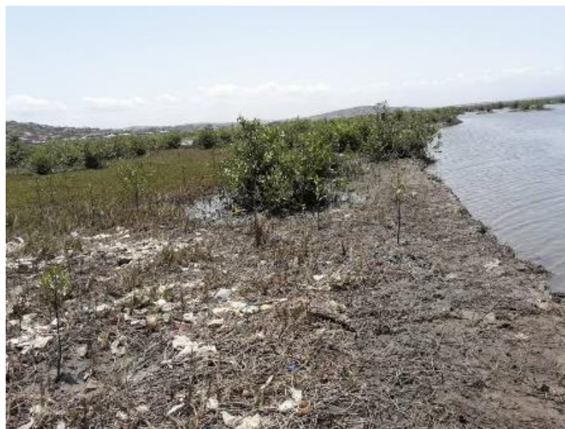
Figure 7 Plastic pollution in the Delta River