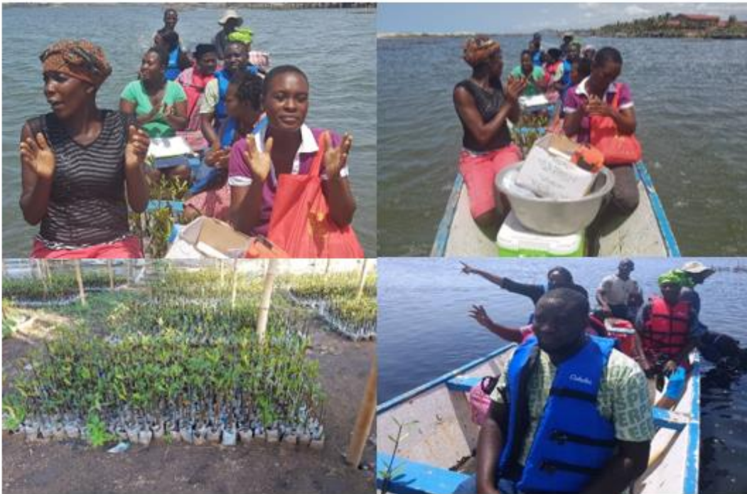
Figure 1 Densu river tour group