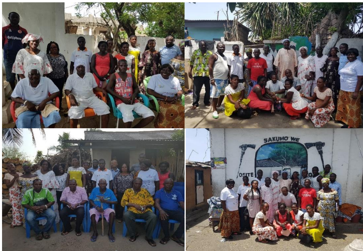
Figure 2 Community visit - elders of Sakamore, Bationor and Kokrobite who welcomed us and hosted the exercise for the whole day

It is tradition to visit and inform all community heads and heads of the fishing villages to announce your mission before being welcomed to start any program successfully. The team visited the three communities of Sakamore, Bartianor and Kokrobite who welcomed us and hosted the exercise for the whole day.