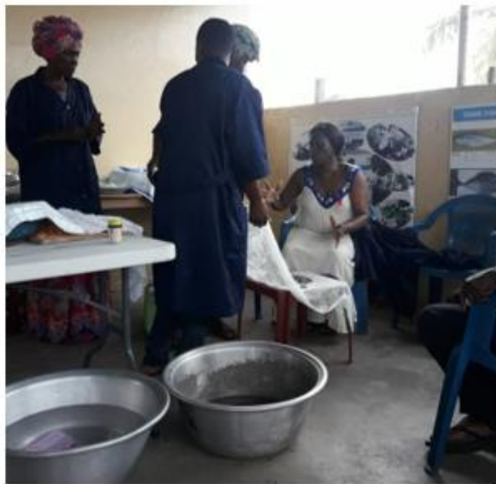
Figure 4 Cooking session