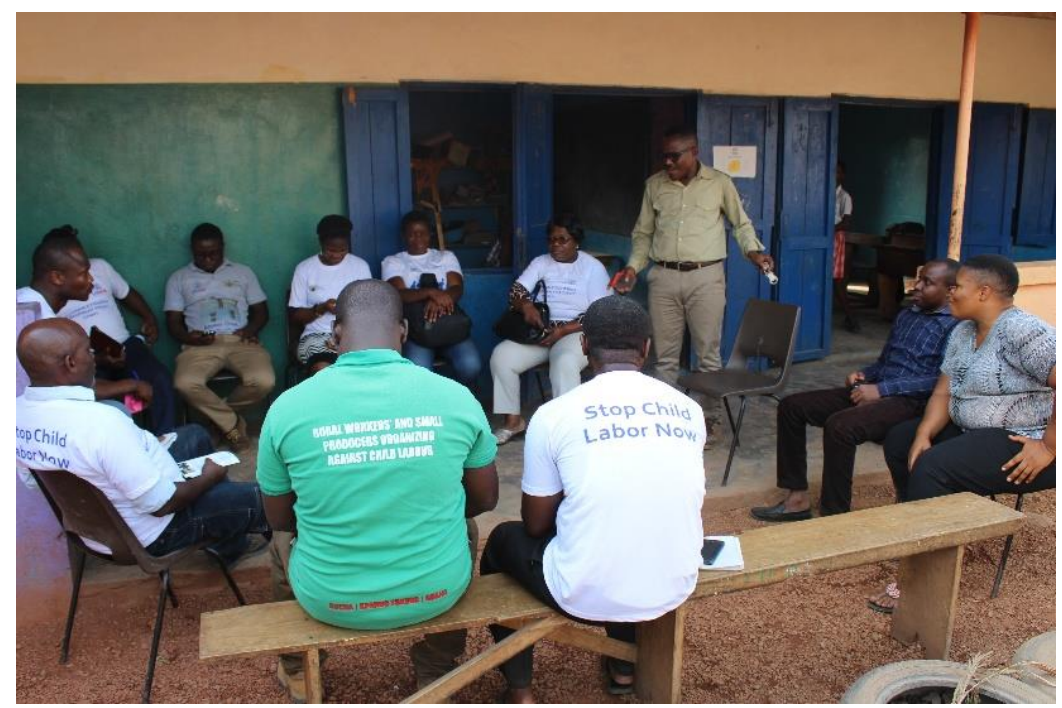
Figure 7 Partners in a brief meeting with the Missahoe Orphanage (One of the orphanages that house the CLaT victims)