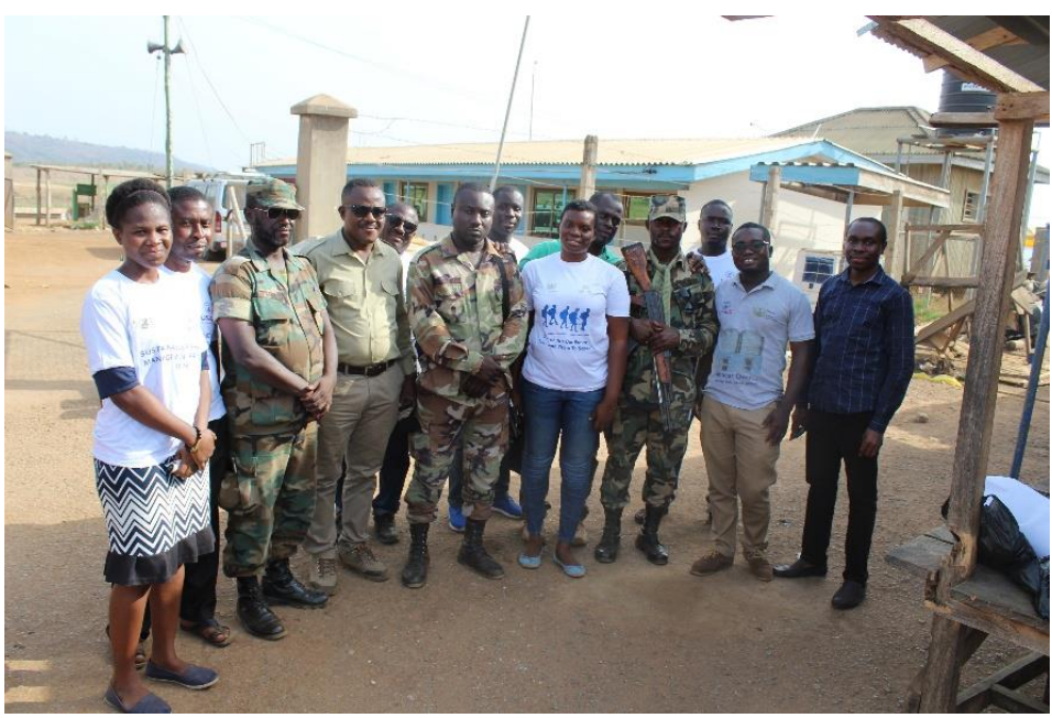
Figure 6 Section of partners in a group picture with the Ghana Armed Forces servicemen stationed at Kpando Torkor