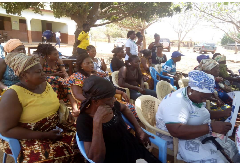
Figure 9 Meeting with members of NAFPTA to educate them about the new fish smoking technology