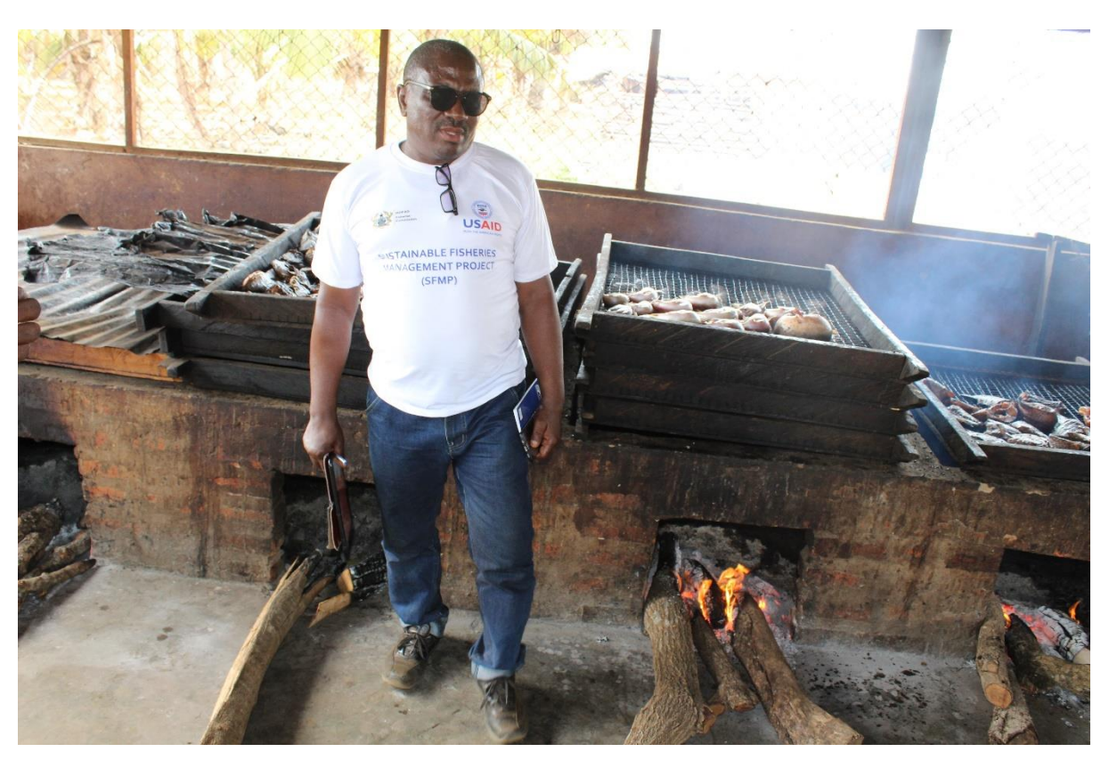
Figure 5 The type of oven used by Torkor Fish processors