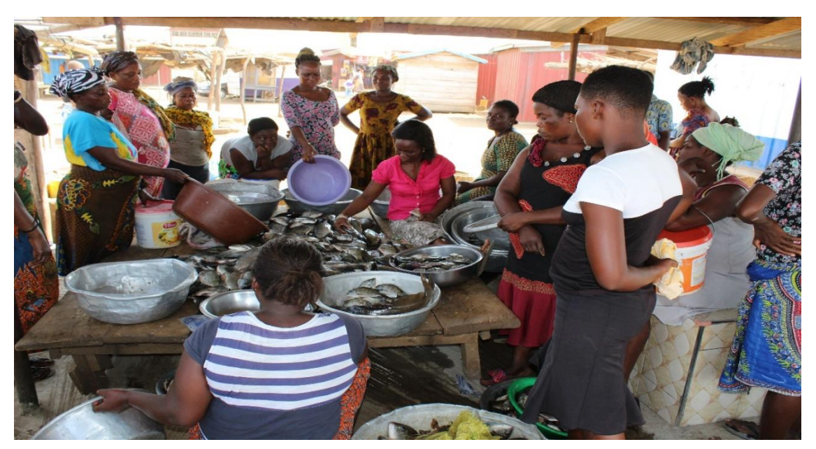
Figure 4 Fresh fish mongers

• The fish after harvest are kept for a long time without ice usage. They were advised to use ice.