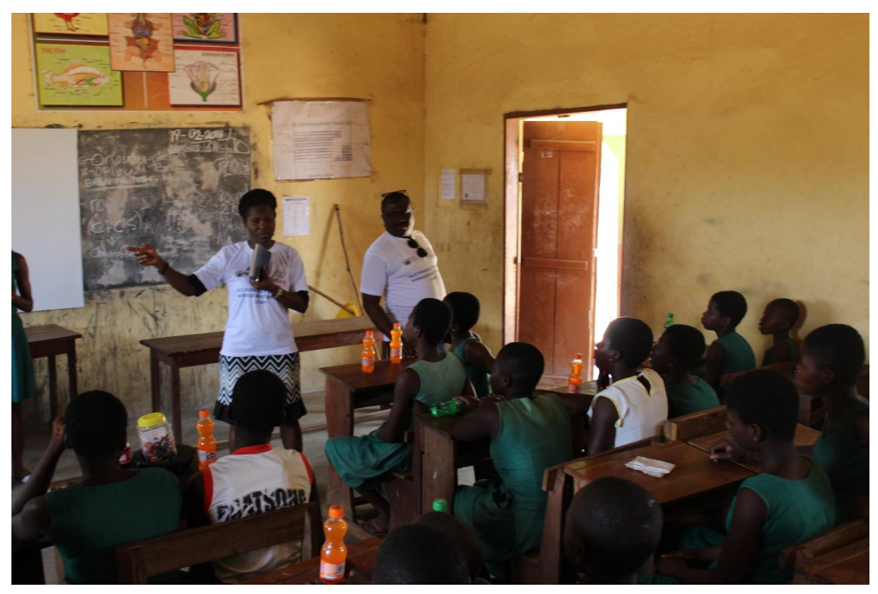
Figure 2 Breakout session with the school children