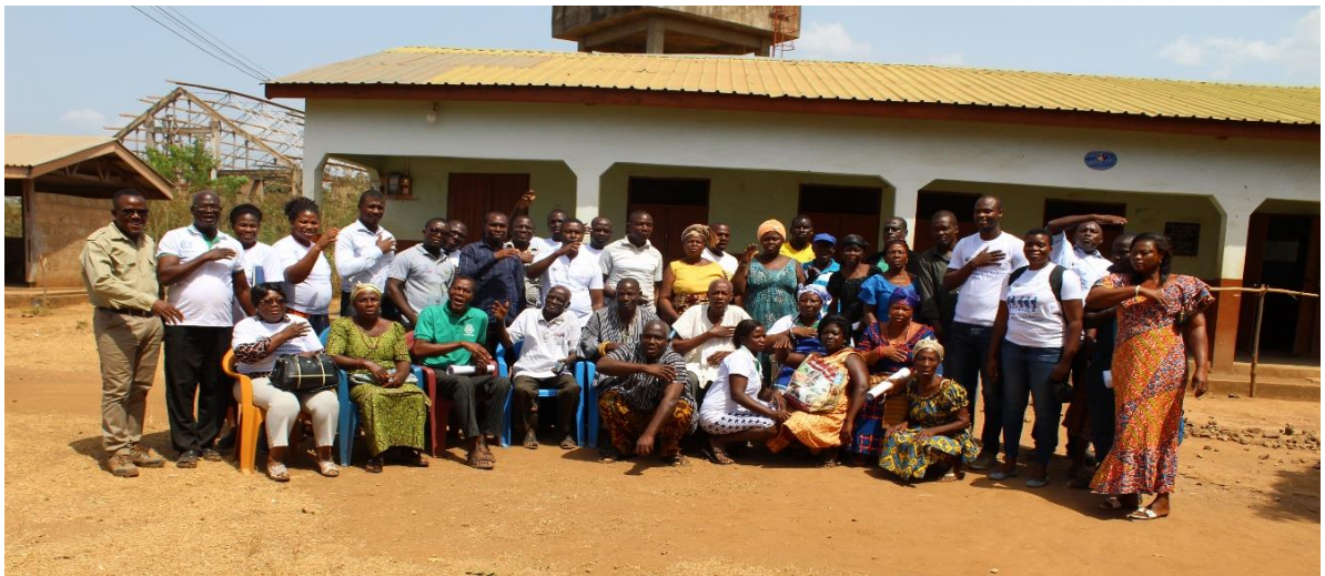
Figure 3 SFMP anti-CLaT team and the community pledging to support to make Kpando Torkor a CLaT-free community