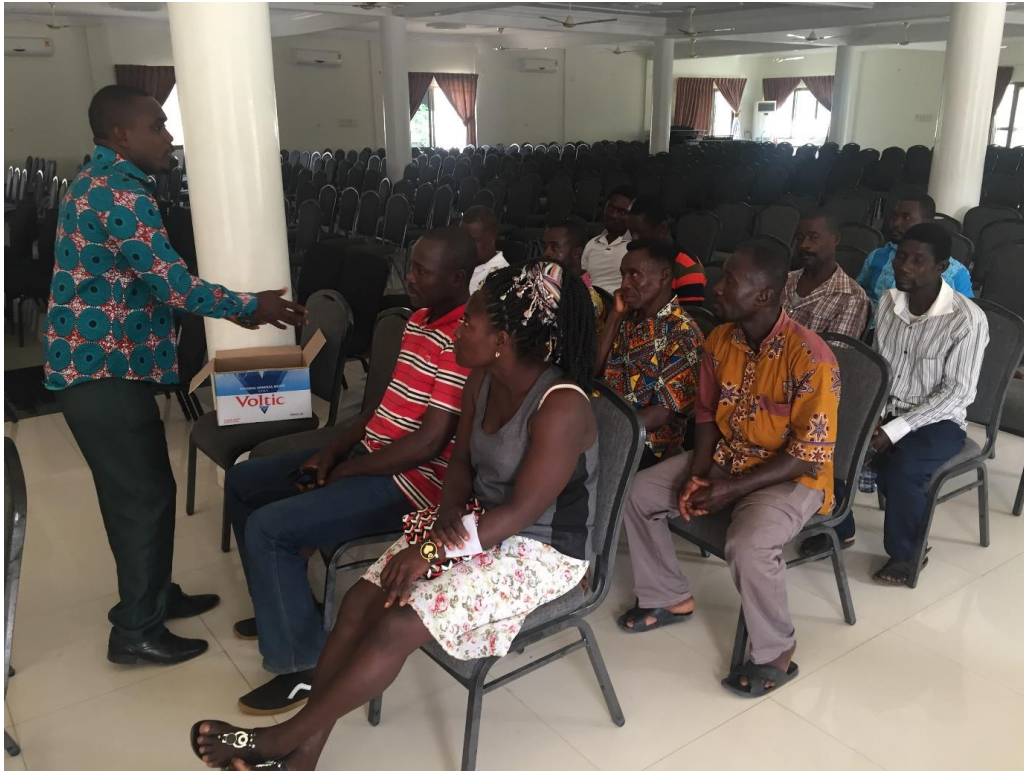
Figure 5: Chairman of the dissolved co-management committee facilitating the election of executives of the reconstituted co-management committee