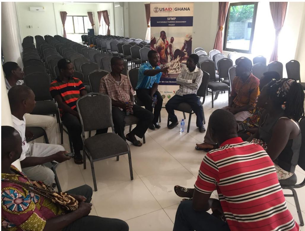
Figure 6: reconstituted co-management committee electing their executives