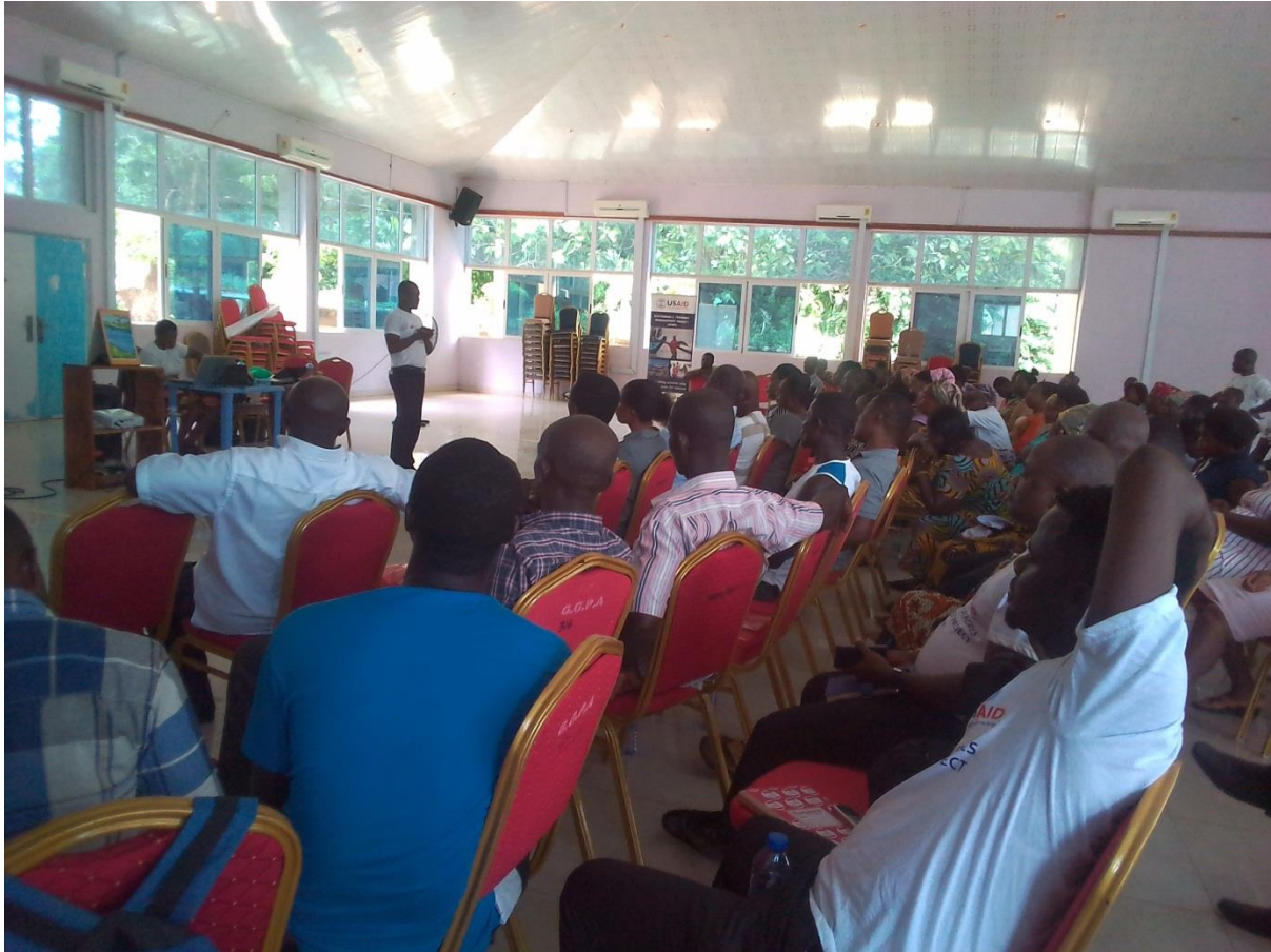
Figure 2. Social Welfare Officer (standing) making a presentation

the protection strategies. The illustrations increased the participants' understanding on CLaT issues and the strategy in protecting the child.