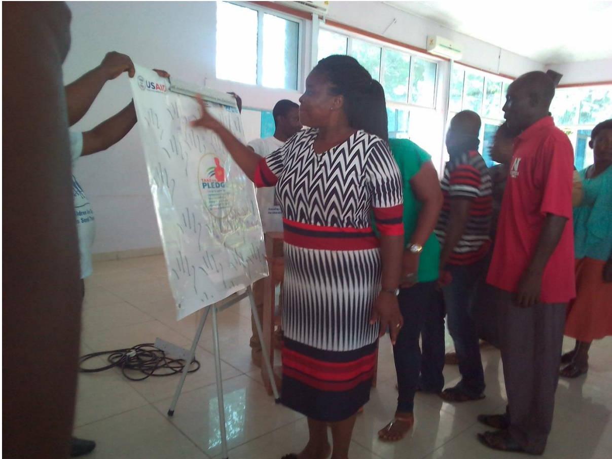
Figure 7. A participant taking a pledge on the pledge banner to support CLaT free zone implementation after the workshop.

The training was successful and the expectations met. The participants now understand that shared responsibility is essential in combating CLaT, with some pledging to assist the needy children when the need arises.