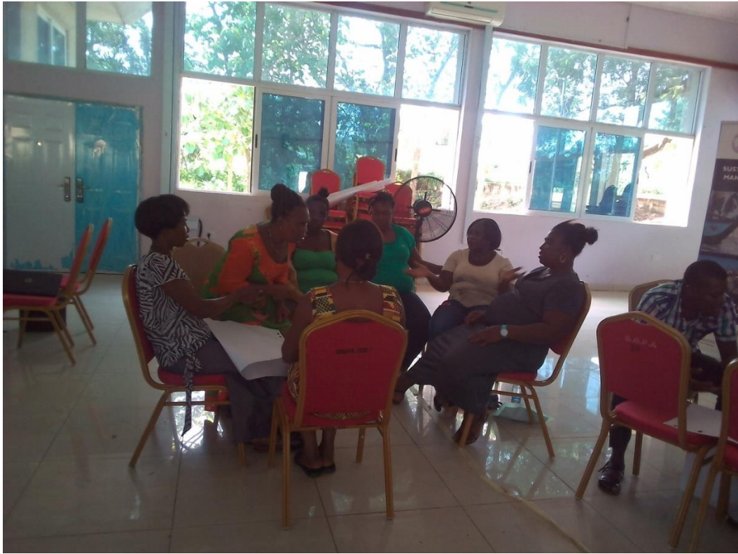
Figure 3. Hair dressers group discussing implementation strategies