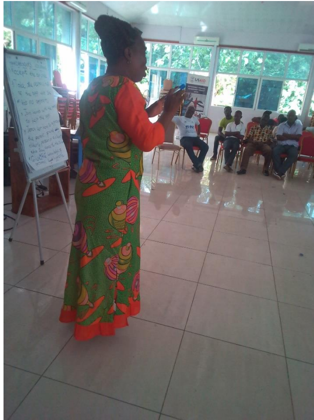
Figure 5. A participant making presentation on implementation strategies on behalf of the hairdressers