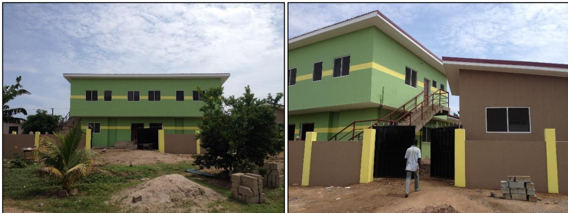
Figure 5. Pictures of the almost complete DAA Fisheries Training Center building

Mikadu finally completed the building in December, 2017 and took care of defects that were identified with the building, during the defect liability period that, lasted till April, 2018. In May 2018, another contract was signed with Mikadu, to take care of the beautification of the Center. This contract involved works such as paving's, gravelling of the compound, a security office and growing flowers in and around the compound. Thus Mikadu Construction Ltd finalized all works on the DAA Center in June, 2018, just in time for the handing over ceremony.