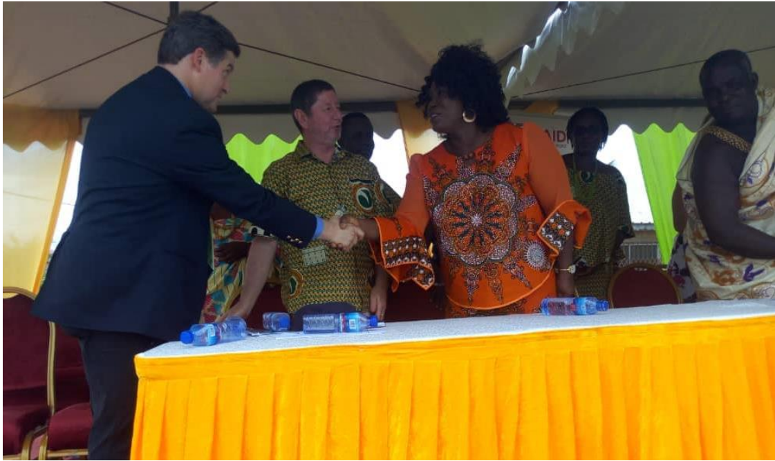
Figure 8. The Minister being introduced to the URI Director