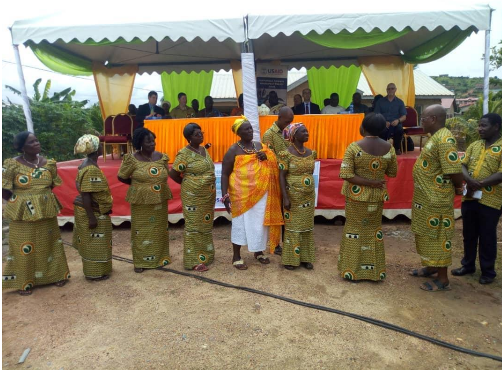
Figure 7. DAA leadership giving the vote of thanks