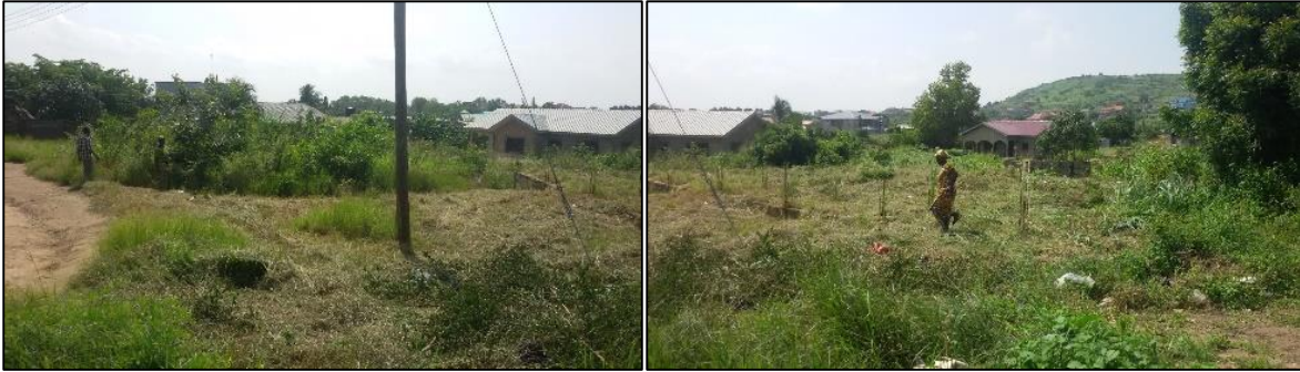
Figure 2. Pictures showing the site for the construction of the training center