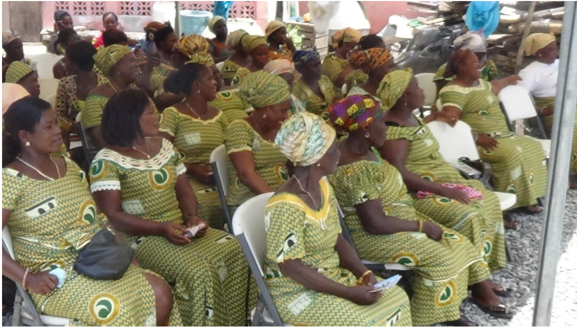
Figure 1. A section of DAA members at the Inauguration of the temporary DFTC