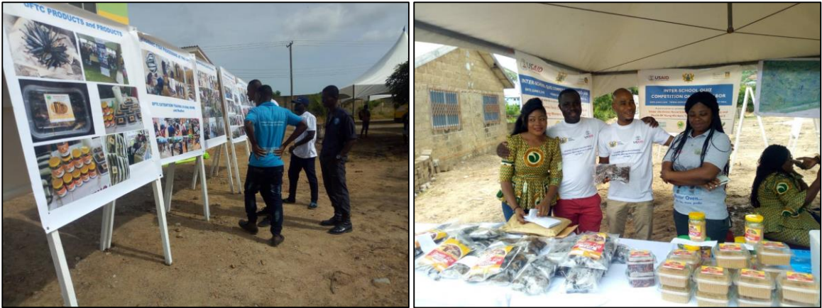
Figure 6. Expects of the exhibition stand