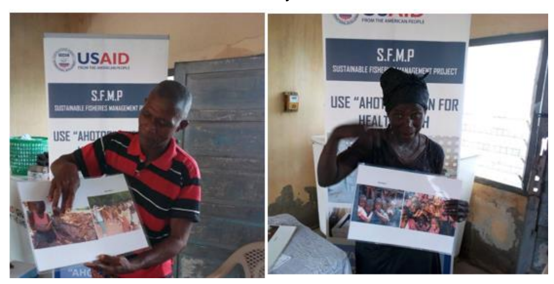
Figure 7: Beneficiaries at CLaT workshop practically identifying the differences between child labor and child work through a picture