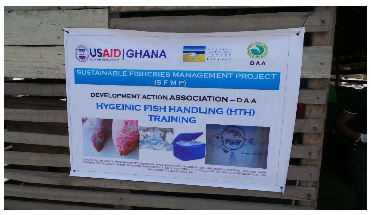
Figure 3. A banner showing a proposed training on hygienic fish handling in a fish processing community