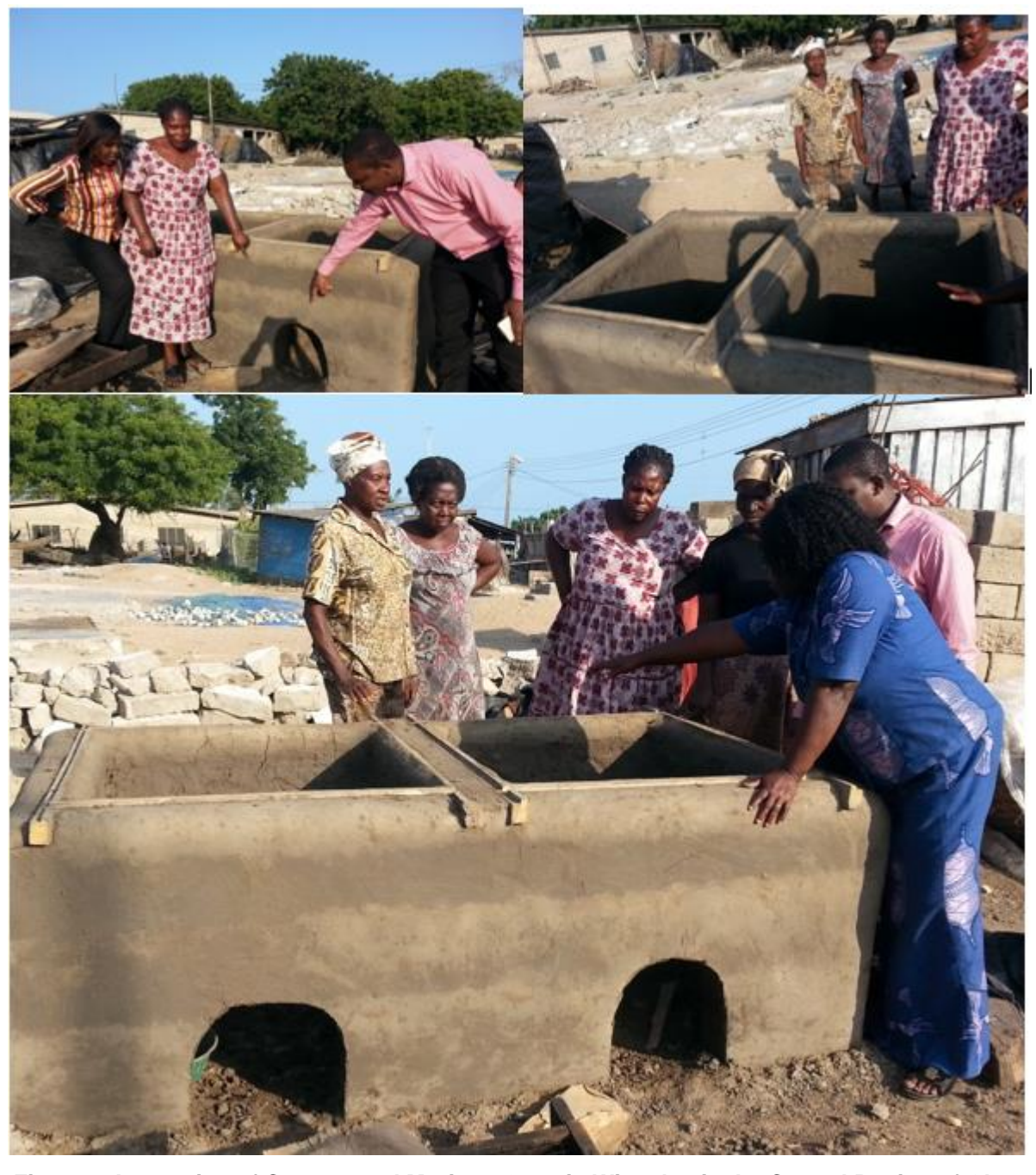
Figure 1. Inspection of Constructed Morison Oven in Winneba, in the Central Region of Ghana