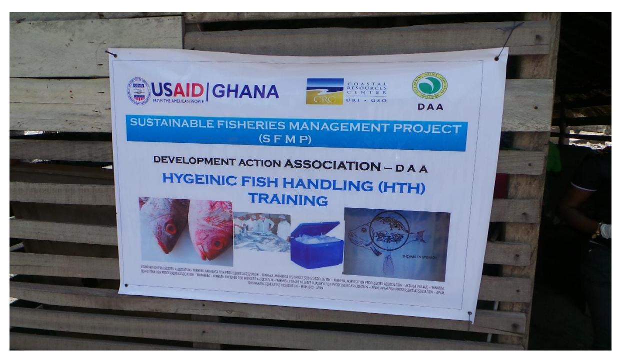
Figure 3. A banner showing a proposed training on hygienic fish handling in a fish processing community