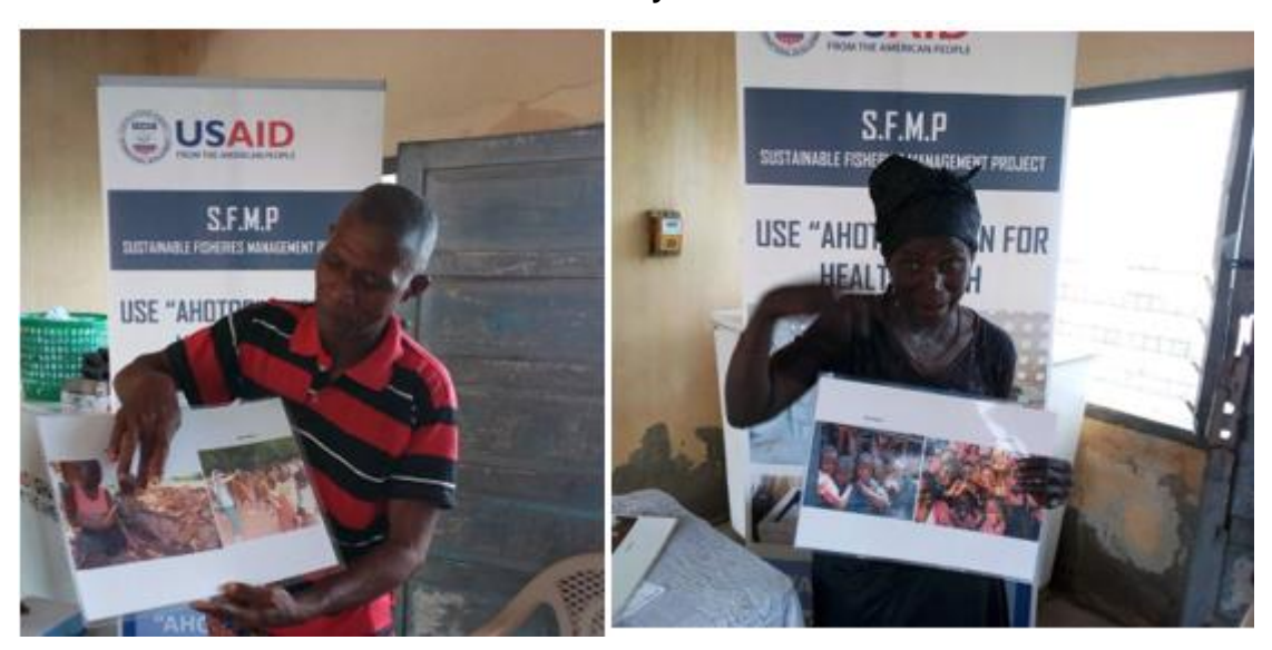
Figure 7: Beneficiaries at CLaT workshop practically identifying the differences between child labor and child work through a picture