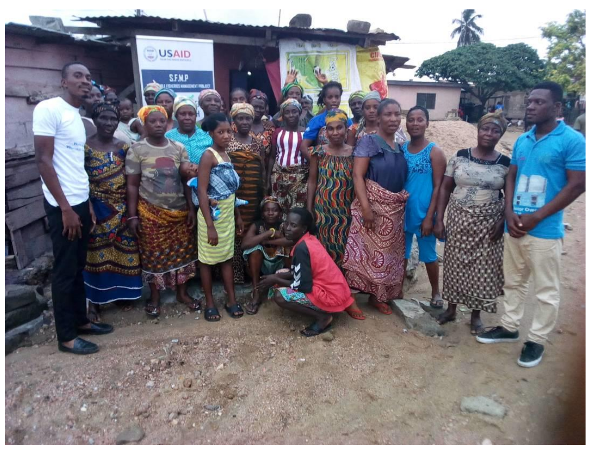
Figure 6. A group of fish processors group in Winneba (the Osakem group) who have benefited from a one-day orientation on CLaT