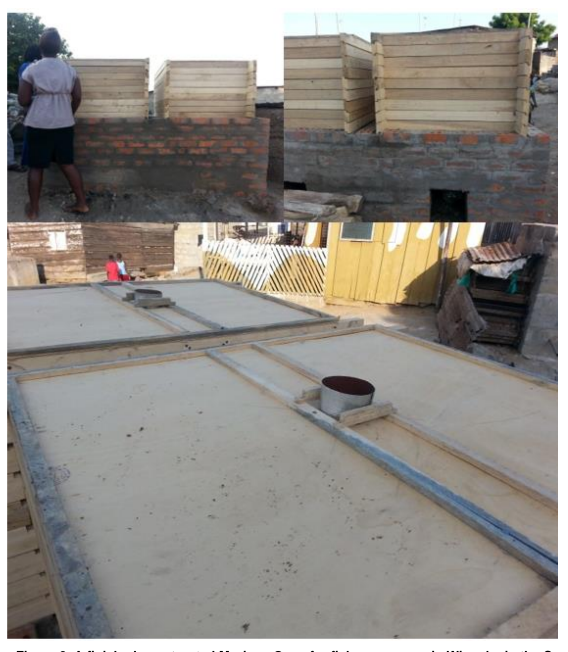
Figure 2. A finished constructed Morison Oven for fish processors in Winneba in the Central Region of Ghana.