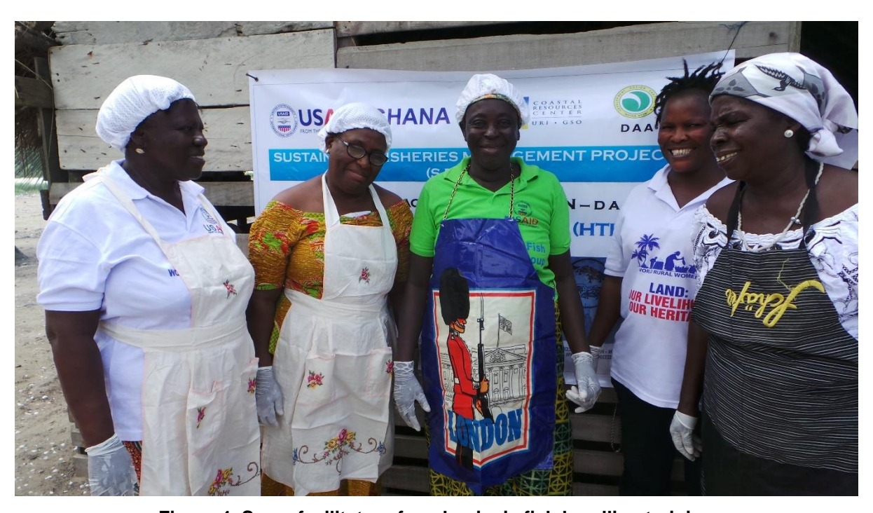
Figure 4. Some facilitators for a hygienic fish handling training