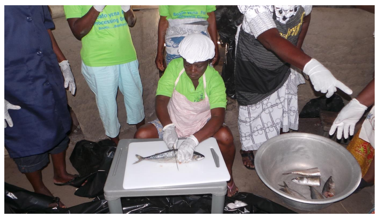
Figure 5, A hygienic fish handling training in progress in Winneba in the Central Region of Ghana.