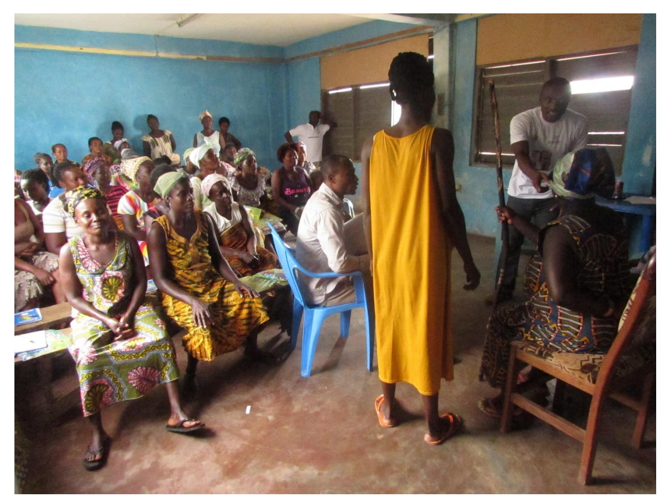
Figure 5 A drama being performed to give a clear understanding of the topic