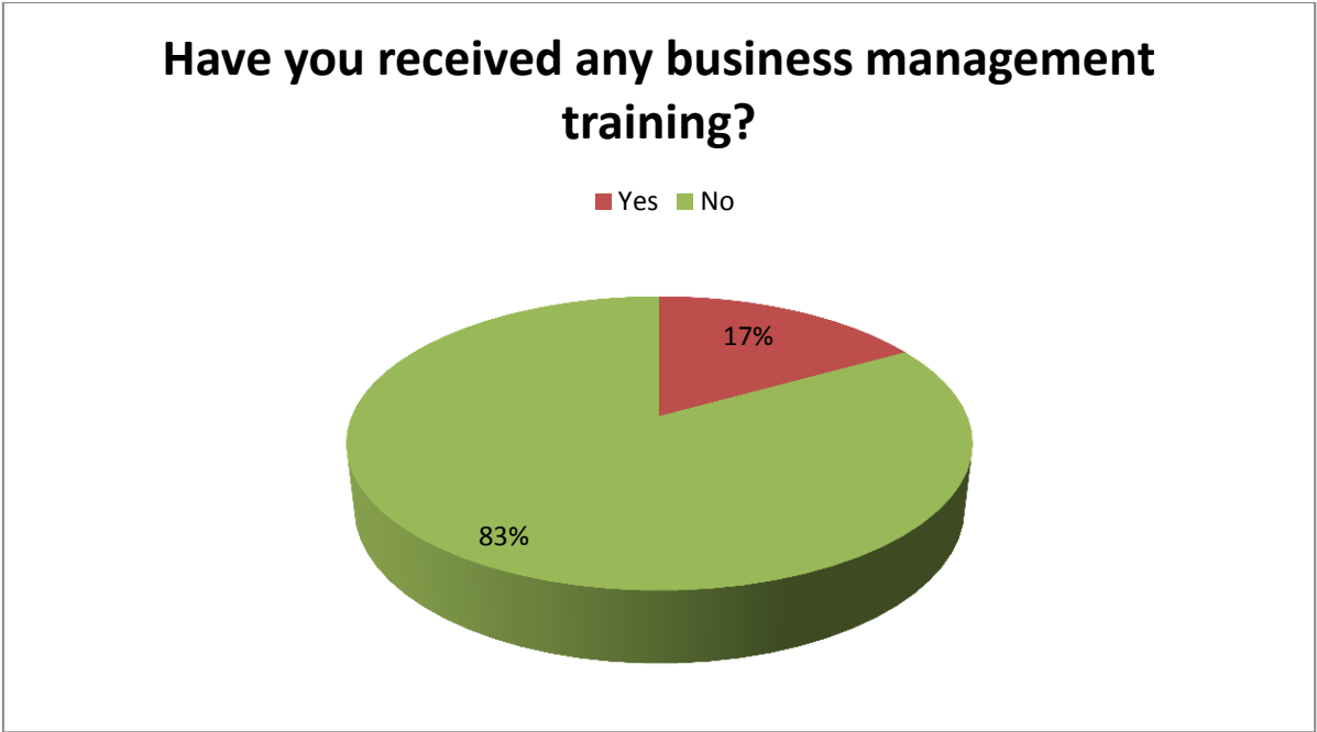
Figure 2 Questionnaire Response 1