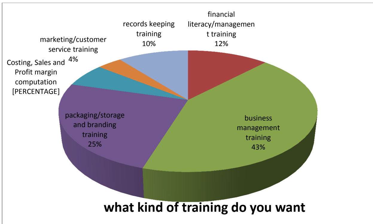
Figure 4 Questionnaire Response 3