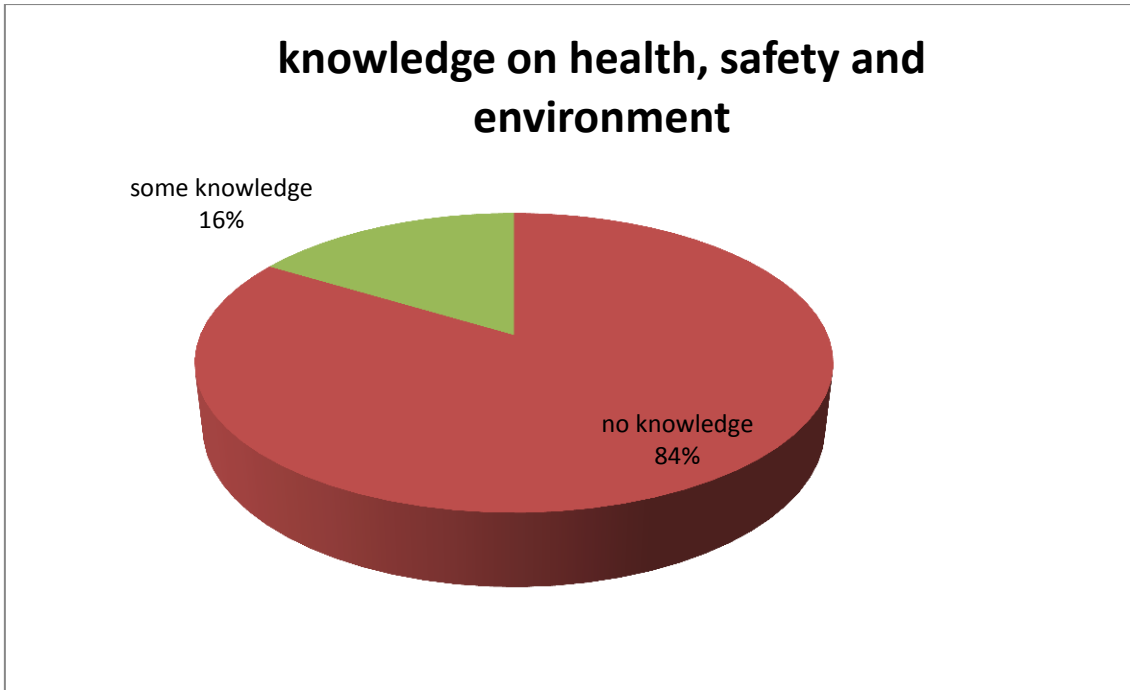
Figure 5 Questionnaire Response 4