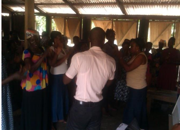
Figure 13 (Top) Trainees making contributions to the topic. (Bottom): Participants engaging in an energizer