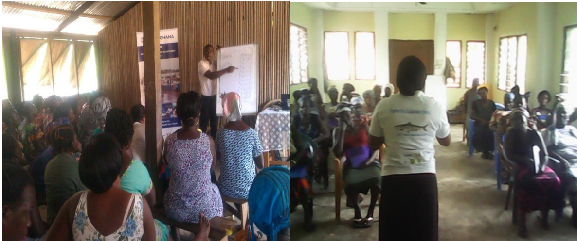
Figure 2 Training sessions in some of the venues (Ankobra and Shama)