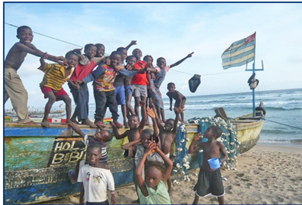
Far left, a woman sells fish in Tema. Near left, children play on a canoe.

USAID has selected the Coastal Resources Center (CRC) at The University of Rhode Island's Graduate School of Oceanography as lead implementer of the SFMP. In leading the project, CRC will work with The Ministry of Fisheries and Aquaculture Development and the Fisheries Commission along with a consortium of international and local partners, including SNV Netherlands Development Organization, SSG-Advisors, Hen Mpoano, Friends of the Nation, the Central & Western Fish Mongers Improvement Association in Ghana/CEWEFIA, Daasgift Quality Foundation Development Action Association (DAA), and Spatial Solutions. The project also will contribute to the strengthening of marine and fisheries management capabilities at the University of Cape Coast and coastal spatial planning capacity of districts in the Central and Western Regions.