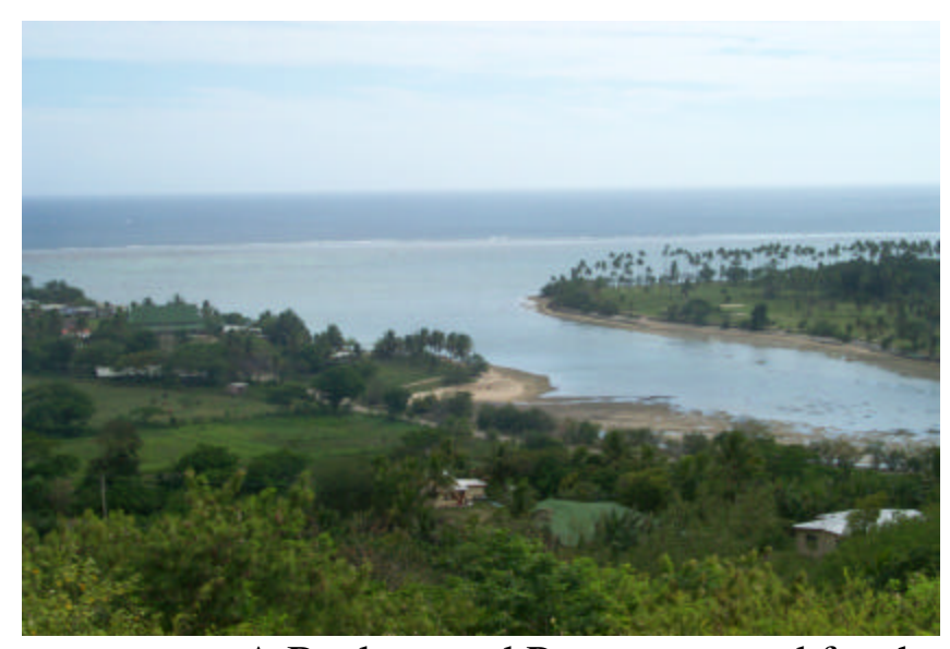
A Background Paper prepared for the Fiji National Workshop on Integrated Coastal Management: April 9-11, 2002 Suva, Fiji