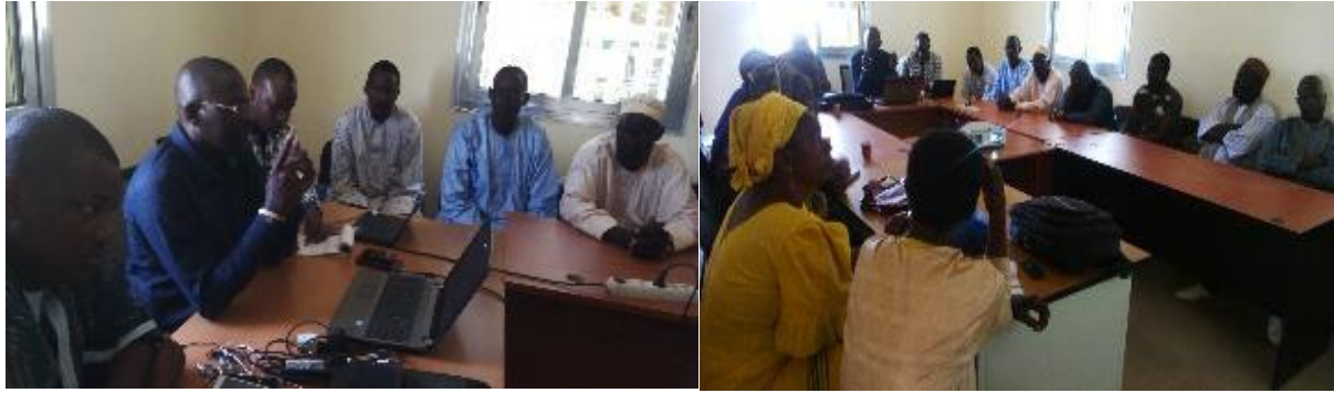
Photos 6 & 7: Setting up the regional network of the CLPAs of the Region of Louga

The positions to be filled are: one coordinator; one administrative affairs officer; one finance officer; one information, sensitization and communication officer; one management officer; one fisheries and environment officer; and one partnership, external relations and fund-raising officer.