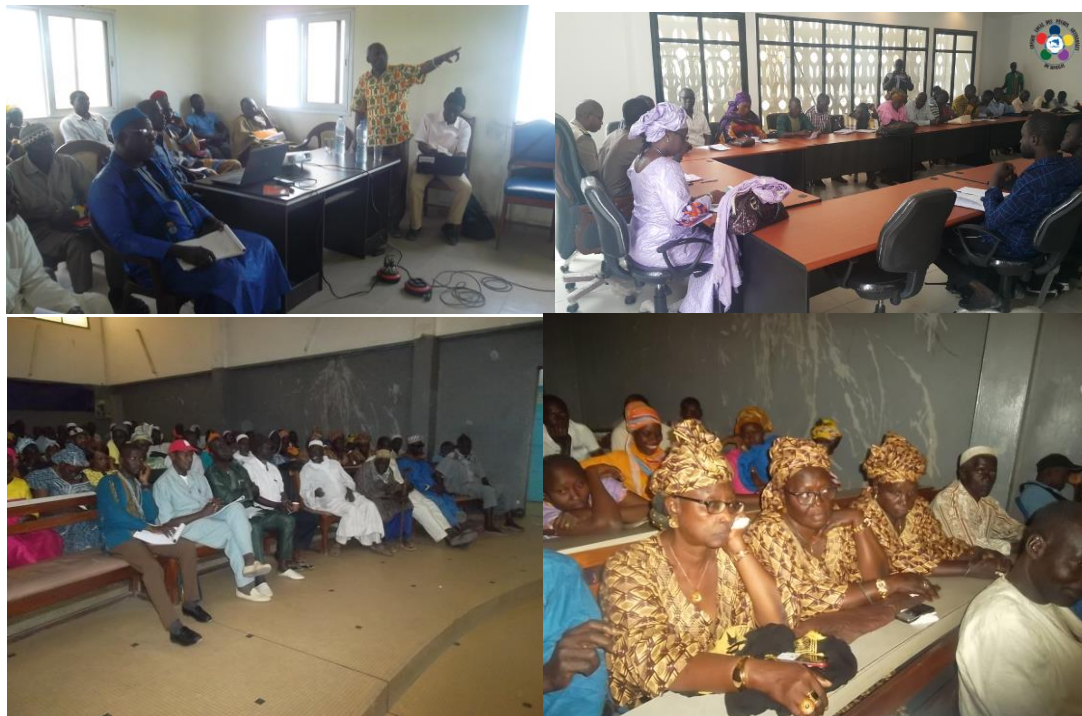
Photos 8, 9, 10 & 11: Installation of network members of the CLPAs of the Region of Fatik

Furthermore, in view of the importance of this new structure for the sustainable management of fisheries, training will be provided to the new members of the CLPA network so that they can discharge their responsibilities and fully play their roles.