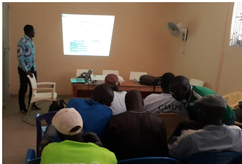
Photo 5: Selection and installation of network members for the Department of Fatick