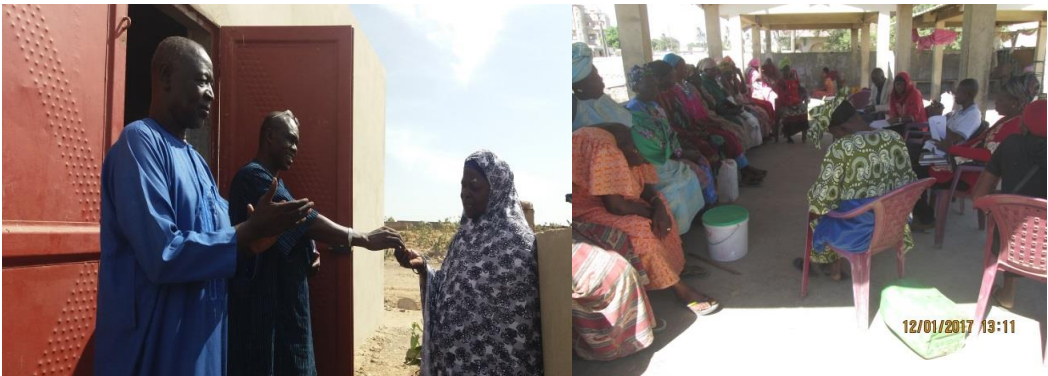
Photos 13 & 14: Commissioning the Guéro storage warehouse by the Committee Chair

Evaluation of Hygiene Charters and Committees. The evaluation of the Hygiene Charters was carried out with the beneficiaries and other project partners with a focus on the conditions for implementing the plan of action and monitoring the activities of the CLPA committees of Rufisque/Bargny, Sindia Nord/Sud, Joal/Fadjouth, Mbour and Sine Saloum. A critical analysis of the performance of implementation identified strengths and weaknesses in compliance with rules and discussed alternative income-generating measures. The analysis also raised the issue of improving the sustainability of achievements in the framework of technical, human and logistical capacity building for women.