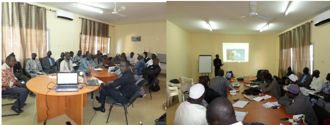
Photo 36 & 37: Overview of participants at training on electronic archiving of CLPAs

The purpose of the electronic archiving training was to assist CLPAs in safeguarding, securing and accessing their electronic data easily using the computers provided to them by the project. At the end of this training, the coordinators and community participants, representing the CLPAs at the training session, were able to create directories/files to house their various data (administrative and financial management, laws and regulations, reports, correspondence, etc.). Participants were also introduced to the use of search engines, such as Google and Bing, to search for information via the Internet on artisanal fishing in Senegal (e.g. the fisheries code) and elsewhere.