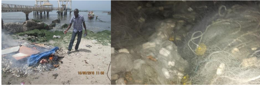
Photo 22: Incineration of juveniles; Photo 23: Fishing gears seized in Ziguinchor

Assessing the implementation of CLPA's internal fundraising strategies. This activity is in the framework of monitoring the strategy implementation as defined by the CLPAs to generate financial resources to finance their activities. The evaluation was conducted in three CLPAs. Three workshops were organized in the Yene/Dialaw, Sindia Nord and Mbour CLPAs, with the main objective of assisting stakeholders to assess the implementation of the fundraising strategies implemented over the past few years.