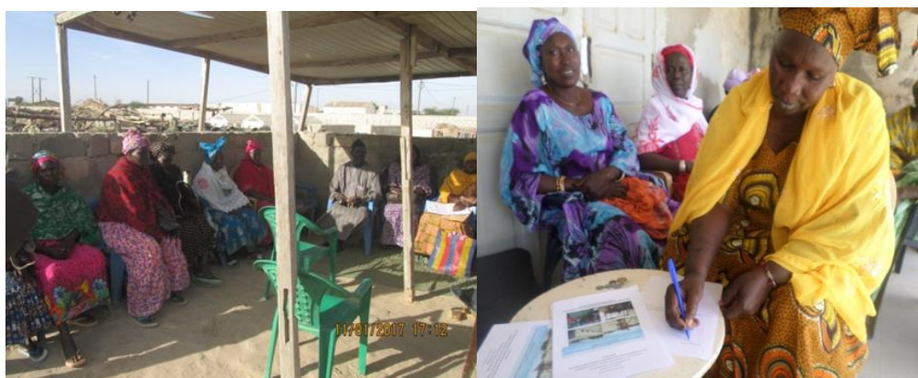
Photos 15 & 16: Meeting with women in Sendou and approval of the Diamniadio and Missirah Charter