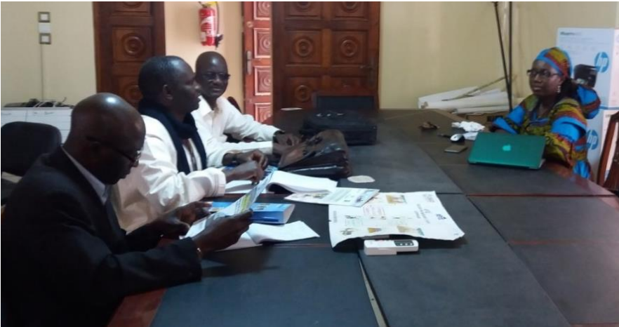
Photo 12: Meeting with the Directorate of Literacy Training and National Languages (DALN)

Exchanges have also been initiated with the Directorate of Literacy Training and National Languages (DALN) and the National Agency for Renewable Energies (ANER) to synergize all interventions on the ground through their programs of "Support to vulnerable women and community-based local development". This consultative process to create institutional synergies coupled with a system of knowledge and technology transfer to all stakeholders and beneficiaries of the project is part of the project exit strategy for long-term project impact.