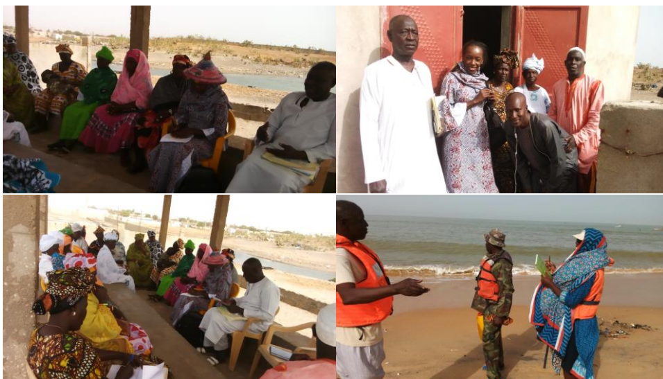
Photos 32, 33, 34 & 35: Site visits in Géréo and sea outings during OCA training

A site visit organized on the last day gave an opportunity to make an outing at sea and discuss with the supervisory committee of the CLPA. The afternoon was devoted to a visit to the artisanal processing site of Guéréo.