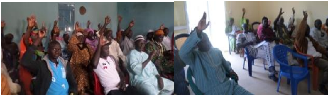
Photos 26 & 27: Protocol validation session in the CLPAs of Bassoul and Niodior

Validation of a Memorandum of Understanding between the CLPAs and the Project. An MoU with the CLPAs for the Local Convention development process was drafted. This protocol commits both parties, and will then be validated by the ICCs of the CLPAs concerned. Following meetings, the 7 CLPAs validated this project partnership document for the implementation of the Local Convention. The Prefets and Sous-Prefets, who are also presidents of the CLPAs, have approved the validated documents.