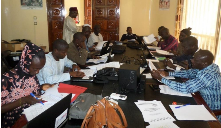
Photo 40: Participants at the session on project communication procedures

The meeting allowed the new staff to familiarize themselves with the project's communication procedures and improve their understanding and compliance with the USAID/COMFISH Plus project's working procedures with the media and partner radio stations.