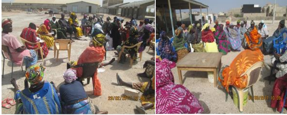
Photos 17 & 18: Working session with women processors of “Mbao and Pencum Senegal” site