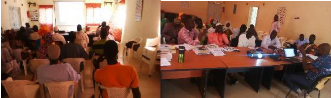
Photos 30 & 31: Stakeholder Training Workshop in OCA (Organizational Capacity Assessment) in the CLPA of Sindia Nord

During three days, the actors diagnosed their organization and identified the organizational constraints that could compromise the proper functioning of the structure. The constraints noted relate to poor governance of the CLPA, the non-alignment with the administrative and financial procedures, lack of effective organization, poor management of the programs, etc. To correct the malfunctions, an action plan has been approved and includes priority actions to be carried out in the next four months (April-July 2017).