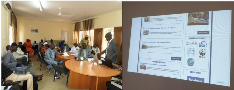
Photos 38 & 39: Training Session at the launch of the CLPA Web site

It is designed and validated with the direct involvement of fisheries stakeholders (CLPA, DPM, etc.). For an improved ownership and sustainability, focal points will be identified in each CLPA to contribute to its operation and updates with a strong involvement of the CLPA secretaries.