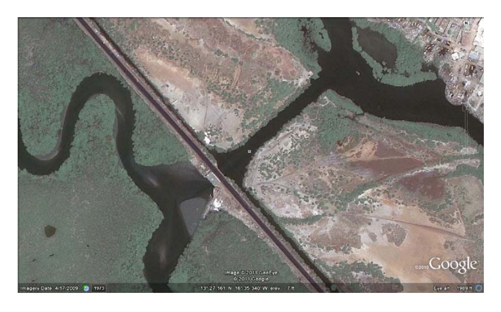
Figure 2. Bund Road Levee showing the Northern Tanbi Wetlands (lower left) and a portion of the Banjul wetlands enclosed by the levee (right) a portion of the urbanized portion of Banjul is visible at the upper right. The drain canal passing under a bridge and the pumping station is the sole normal discharge point of drainage water from Banjul.