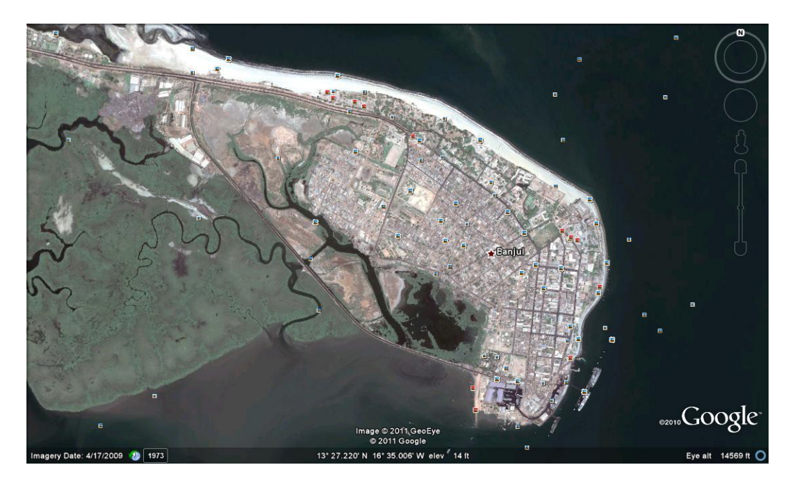
Figure 3 . Satellite imagery of Banjul showing the Bund Road Levee and associated drainage area in metropolitan Banjul.