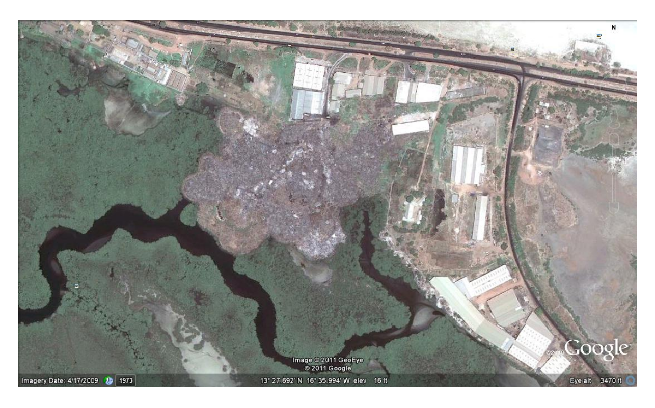
Figure 4 . Rubbish dumping area in the Tanbi Wetlands area (center) near the intersection of Bund Road (right) and the Banjul-Serrekunda Highway (top).