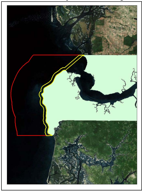
Figure 4. Map of proposed sole special management area and one nautical mile closed zone

Official adoption of the Sole Management plan is expected in the first Quarter of Year 3. One final stakeholder consultative/validation meeting is planned and a tentative date of December 15, 2011 has been selected for an official signing ceremony/launch event. The U.S. Ambassador to The Gambia, USAID/WA and each of the Ministers overseeing the Departments of Fisheries, Parks and Wildlife Management and Forestry will be invited. Adoption of the Sole Co-Management Plan will effectively bring an estimated 158,332 ha under improved management. This represents the area 1 nm out from the Atlantic Coast of the Gambia (14,425 ha) restricted during the sole spawning season and the area up to 12 nm under gear restrictions year round.