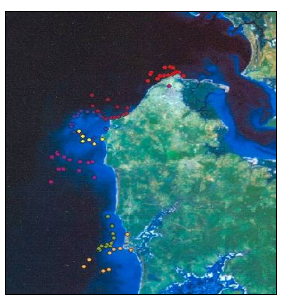
Figure 3. Locations of actual sole fishing from major landing sites