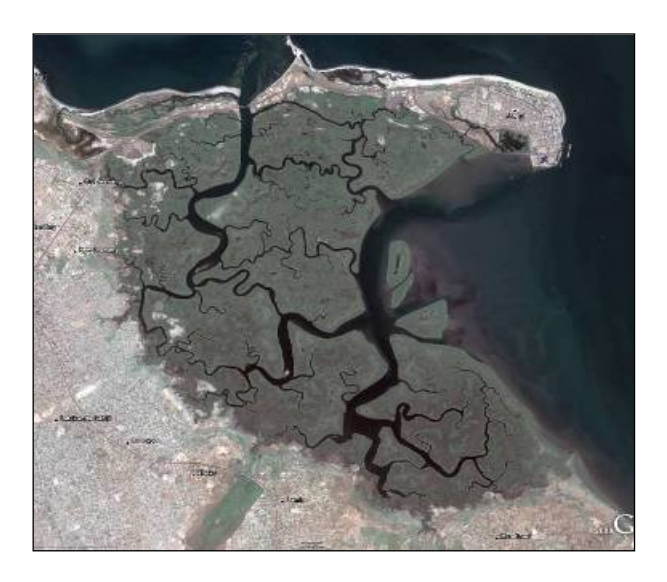
Figure 2. Tanbi National Park