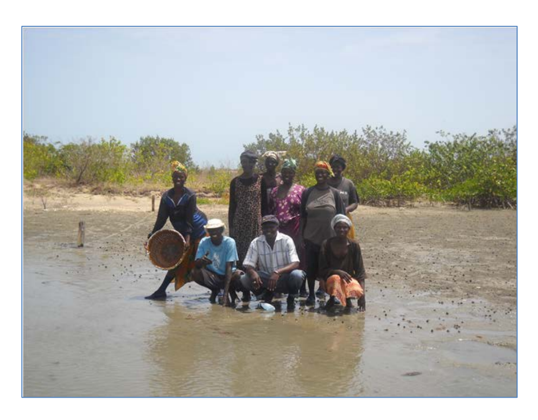
Figure 5. Gambian cockle fisher women and the Gambian fisheries extension personnel on the seeded cockle aquaculture test site in Kartong. Seeded cockles are visible on the surface of the sand flat

Institutional Strengthening of TRY. TRY has made significant progress over the last year consolidating its membership, building trust and regular communications with officers, members and the Board of Directors and raising the visibility of the organization. TRY has been quite successful at fundraising for such a young organization, has been able to start new activities benefitting its members and is about to be signatory to a groundbreaking Oyster and Cockle Co-Management Plan, entitling its members to exclusive user rights to natural resources of economic value. In Year 3, BaNafaa's assistance to TRY will support the establishment of organizational systems and procedures. TRY will be audited by a local auditor and a consultant will work with TRY to develop a Standard Operating Procedures Manual. BaNafaa's support will also provide training for programs that benefit members and build their capacity, literacy and numeracy training and microfinance training. By the end of Year 3, TRY will begin graduating its strongest microfinance clients out to an established Gambian microfinance institution. This will enable TRY to gradually phase out its microfinance activities over time. While the program has been successful and has increased members' understanding of financial management, it is labor intensive for TRY and carries significant risk.