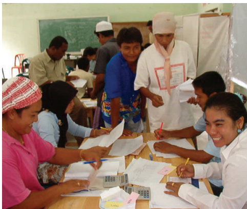
Village Revolving Fund Committee Members enjoyed practicing their accounting skills using play "money" during training provided by Suri Consult

Each village will have its own fund of 1,000,000 baht, for a total of 5,000,000 baht. Each village chose 50 people to participate in the village's fund. Priority will be given to villagers who were directly affected by the Dec. 2004 tsunami. Loan applicants will be required to prepare