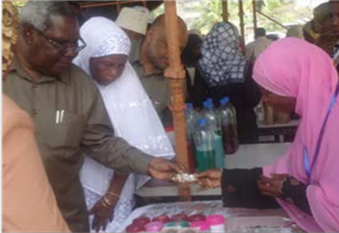
Hon: Seif Ali Iddi ,The Second Vice President of the Revolutionary Government of Zanzibar visiting pearl farmer booth during the launching of the Kisonge Ground Sunday Market; Zanzibar