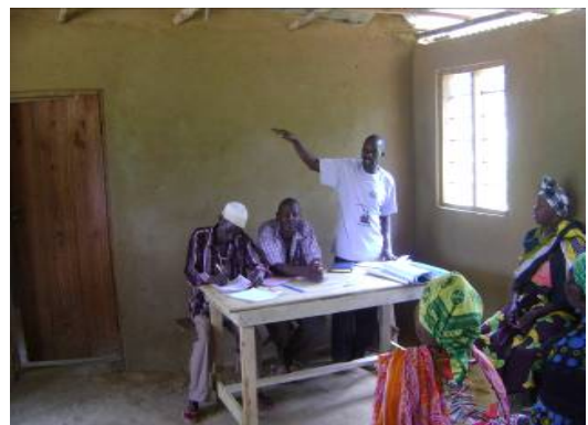
Awareness meeting conducted in Gongo village