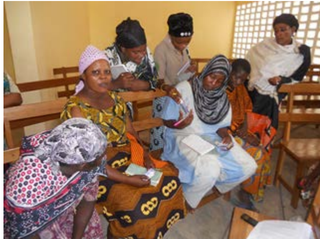
Mwembeni women waiting to pay their dues to join the new SACCO