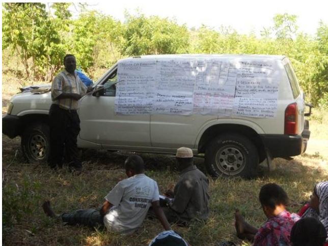
Entrepreneurship training for SACCO members in Ushongo