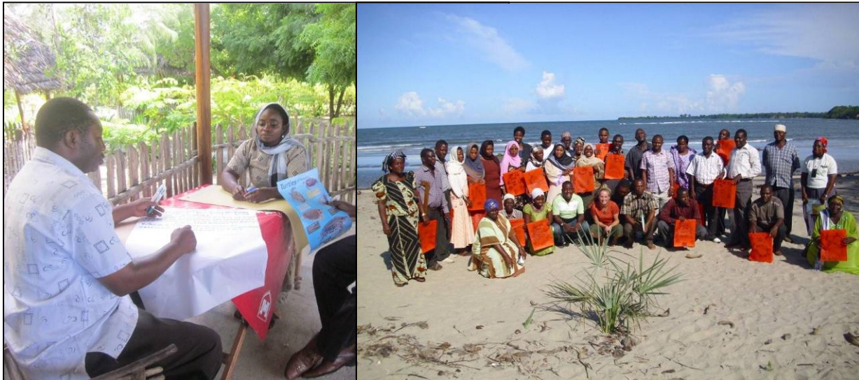
Photos from teacher training workshop