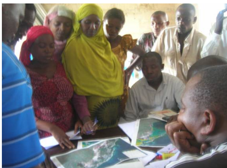
Community members commenting on draft maps