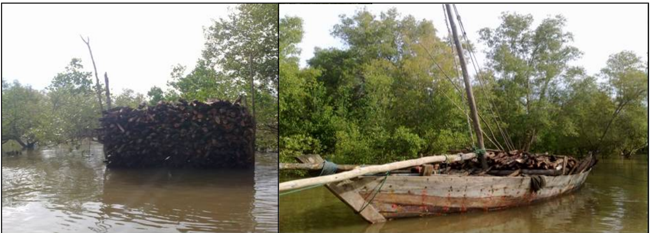
Cleared mangroves stacked in the water and a boat ready to transport illegal mangroves, found in RAZABA –Chalawe River