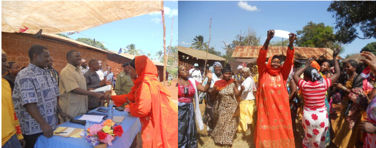
Check hand-over and celebration of UWAMKE opening