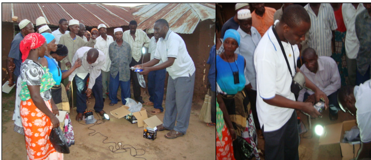
Demonstration of solar powered technologies in the Kitonga village