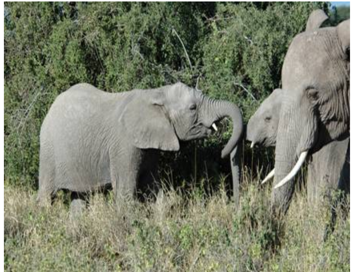
Elephant family in Saadani