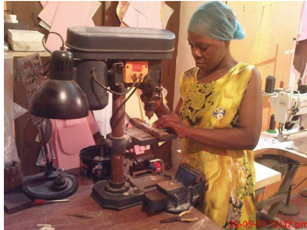
Zanzibari jewelry maker in the workshop established by the European marketer