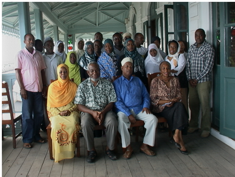
Group of half pearls farming stakeholders, IMS, MBCA Manager, and ReCoMap staff