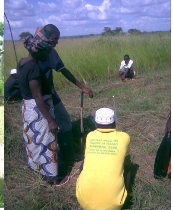
Assisted by the agricultural officer (standing left), villagers prepare for fruit tree planting