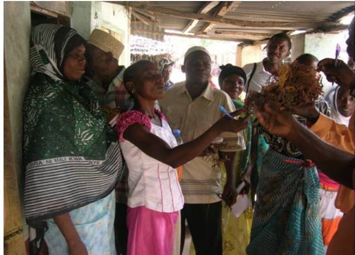
Discussion about how climate change affects seaweed farming, a key income source for women,