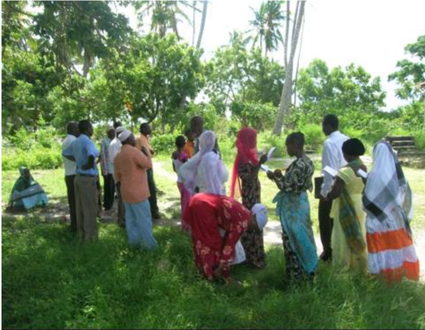
Mlingotini Villagers showing effect of climate change to Kitonga fellows.