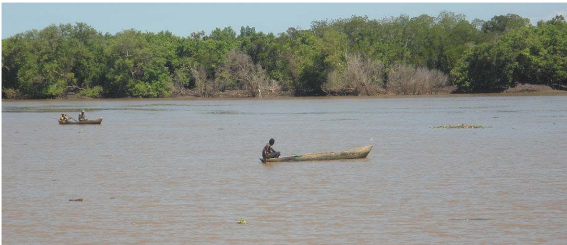
Photo 5. Fishers along Pangani River at Kwa Sapa area