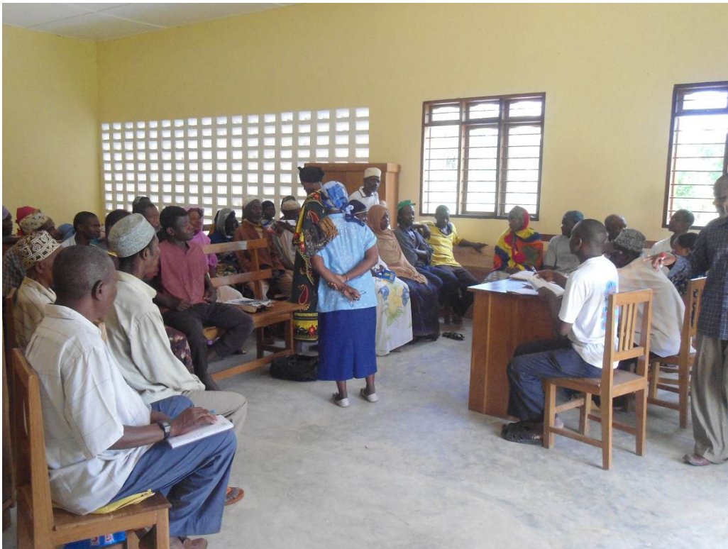
Photo 1. The community members of Mwembeni village during information gathering guided by semi-structured questions

Individual interviews were also held with key village leaders, elders, women and poor or otherwise marginalized individuals to get their views and perceptions so as to triangulate the information obtained. The V&A team included the Pangani District Climate Change Task Force.