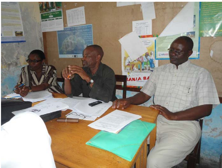
Photo 3. The Pwani assessment team and Pangani District Climate Change Task Force in meeting held in Pangani District Council discussing V&A findings

In the end, the project staff reviewed the findings together with the Pangani District Climate Change Task Force (Photo 3) and drafted an adaptation plan, which was later vetted with the village council