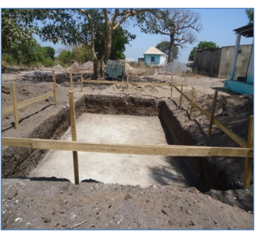
Jeshwang sanitation facilities construction