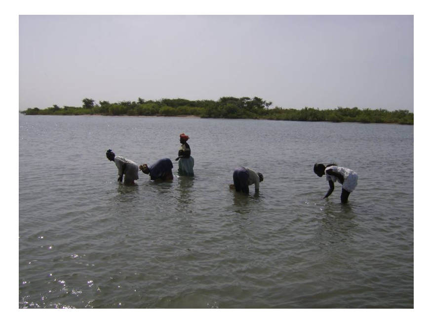
Figure 8. Women of the Kartong village hand collecting blood ark clams ( Anadara senilis ) from the Kartong Estuary.