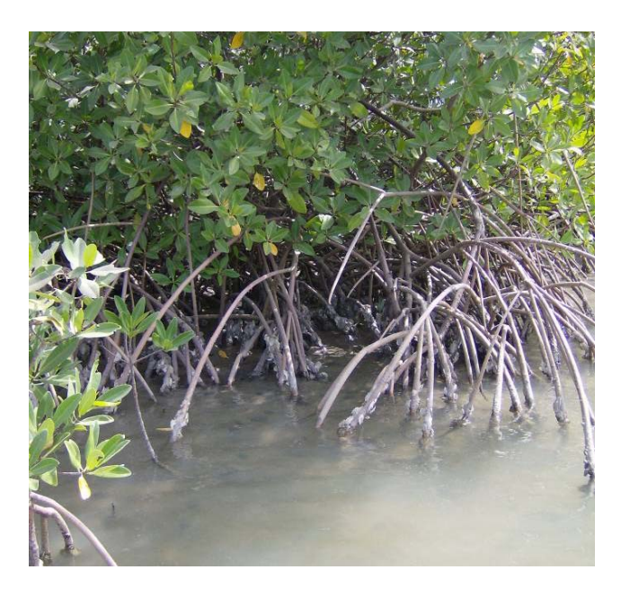
Figure 10. West African mangrove oysters Crassostrea tulipa setting intertidally on the prop roots of the Atlantic red mangrove, Rhizophora racemosa .

The women harvesters of oysters in the Tanbi Estuary system typically work early in the season at most accessible sites closer to their homes to collect oysters from mangrove prop roots (Figure 9). As the harvest season progresses, they venture farther a field and deeper into the mangrove forest in search of larger marketable oysters as the season progresses. One of the by-catch items of the harvesting process are smaller non-marketable seed oyster that are simply culled and discarded. Application of some simple oyster nursery techniques to hold the oyster seed until they can grow to larger marketable sizes may be a means to reduce this by-catch in the oyster fishery and provide the women a convenient opportunity for the women to be learning a simple aquaculture technique to grow and eventually sell the discarded seed oysters.