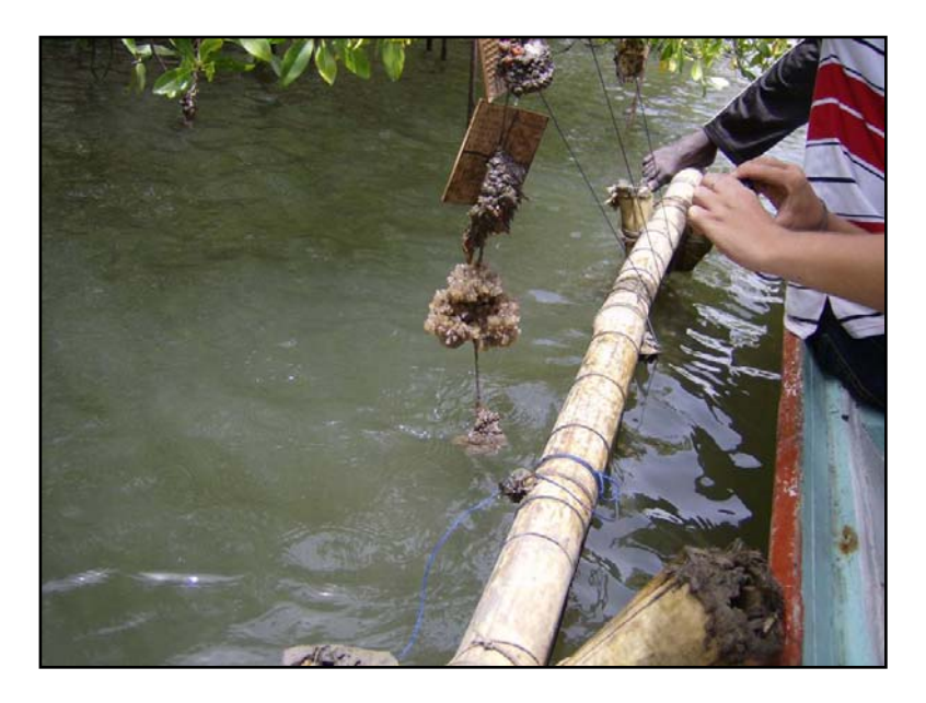
Figure 2. Example of an experimental spat collector in the Tanbi Estuary system in June 2010 fouled by solitary ascidians, possibly Mogula sp.