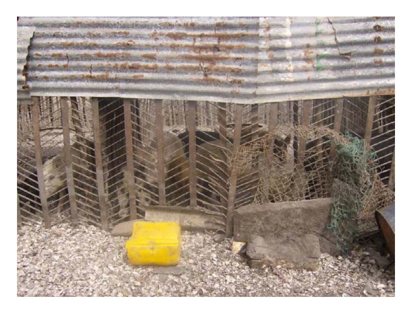
Figure 4. Pigs being raised within the intertidal zone at Old Jeswang. Note in the foreground shells from oysters harvested nearby in the estuary.

Figure 3. A pig pen within the intertidal zone of the Tanbi Estuary system at Old Jeswang, January 2011.