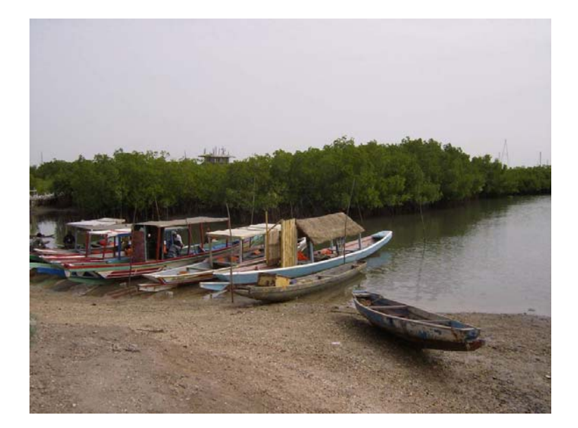
Figure 5 . Fishing boats (foreground), Lamin Lodge Hotel (center left background) and sailboat marina (right background) at Lamin Lodge site January 2011.