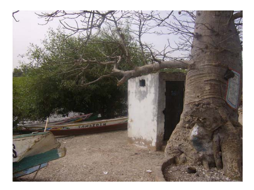
Figure 6. . Pit latrine at the Lamin Lodge site located within 10 meters of mean high tide elevation.