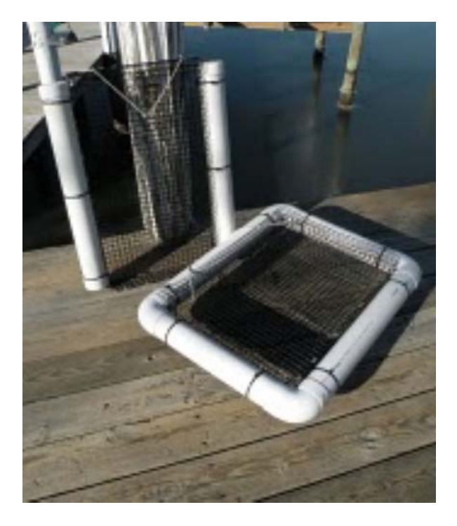
Figure 11. Examples of Taylor float designs used by the Chesapeake Bay Oyster Farm in Virginia, USA. Oyster seed is held near the water surface, and fouling on the apparatus is controlled by periodically flipping the floats in order to expose any adhering fouling organisms to air and sunlight.

Gambia, including vinyl-coated wire mesh material of various mesh sizes, PVC pipes and end caps, as well as nylon cable ties (aka "zipties") were found at hardware supply and automotive supply houses in the Metropolitan Banjul area. It is suggested that a pilot study involving women oyster harvesters to culture oyster seed using to test the technical and economic feasibility of Taylor floats as an adjunct practice to the oyster fishery of the Tanbi. This pilot can be piloted in only one of the nine spatfall monitoring sites that can be easily reached by local harvesters and extension staff. Floats should include several size mesh – small, medium, large mesh – so that as the oysters grow, they can be transferred to progressively larger mesh cages that allow better water circulation.