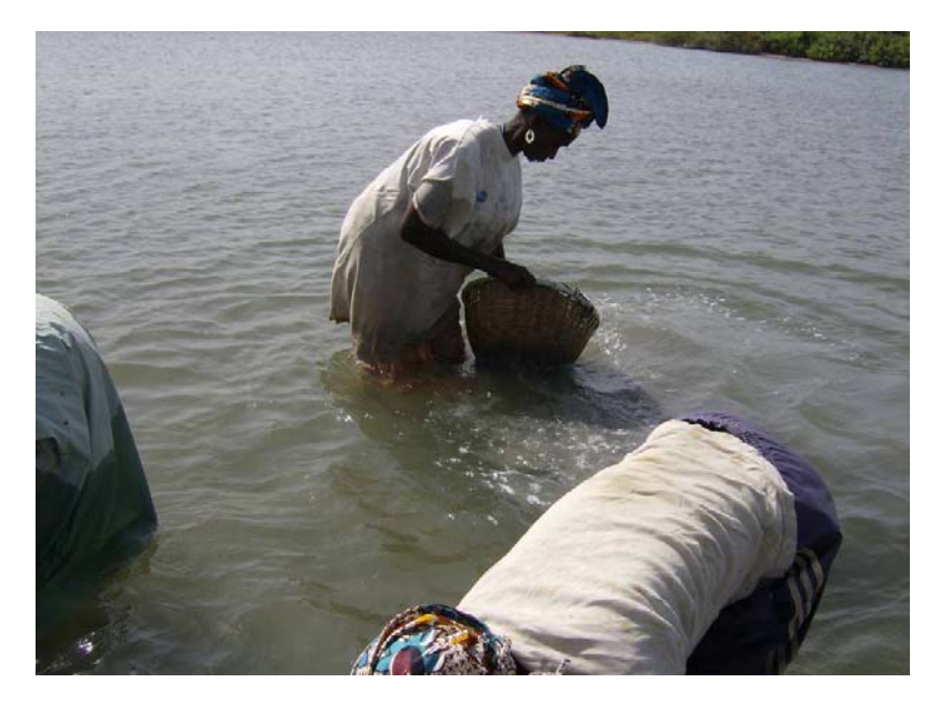
Figure 9. Kartong village woman using a basket to sift clam catch to clean sand from clams and return smallest seed clams to the estuary bottom.