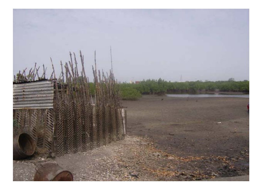
Figure 3. A pig pen within the intertidal zone of the Tanbi Estuary system at Old Jeswang, January 2011.