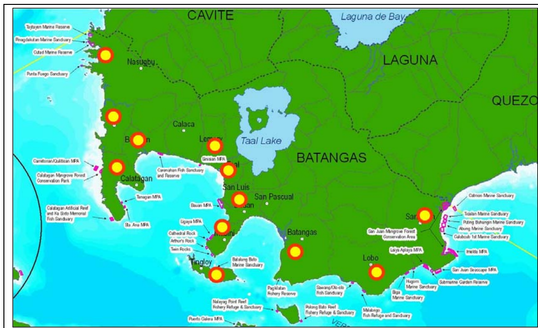
Map 1: Network of MPA in Batangas Province