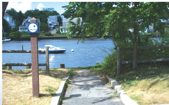
Seaview Park, Cranston

The R.I. Coastal Resources Management Council (CRMC) is supporting these efforts through the development of the Metro Bay Special Area Management Plan (SAMP). SAMPs refine the state coastal program by taking a regional, integrated approach to setting coastal management goals and policies. SAMPs are federally recognized upon state approval.