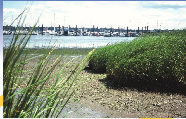
Stillhouse Cove, Cranston