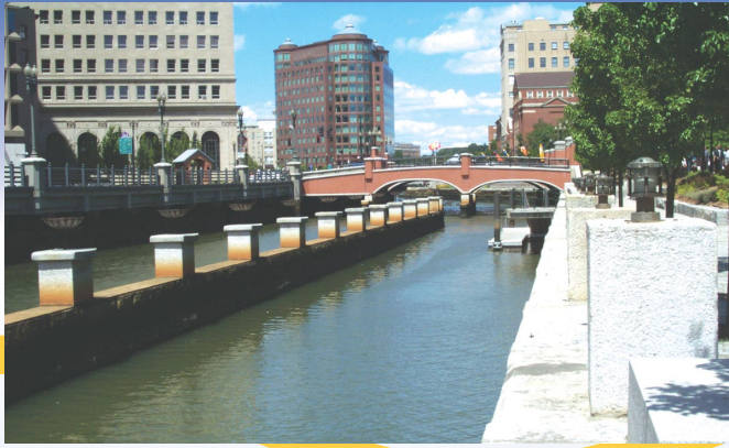
Providence River, Providence