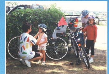
East Bay Bicycle Path, East Providence

Revitalizing Northern Narragansett Bay 2005