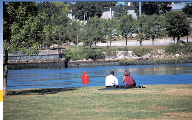
Bold Point Park, East Providence