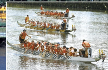
Dragon Boats, Pawtucket