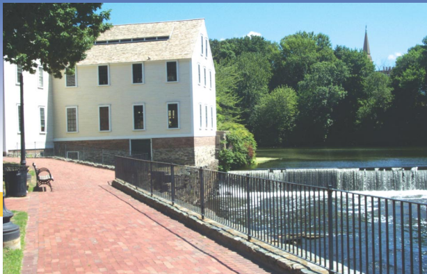
Slater Mill, Pawtucket