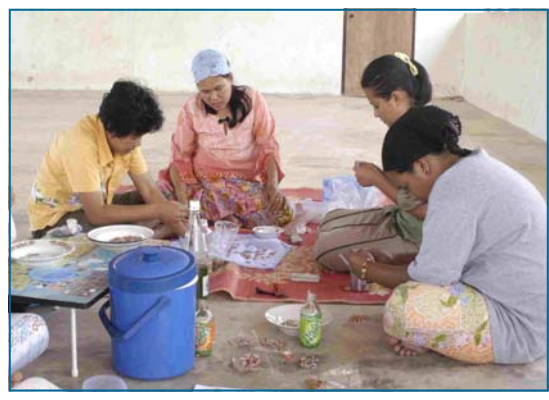
A women's group from Kamphuan receives training in bead jewelry production.