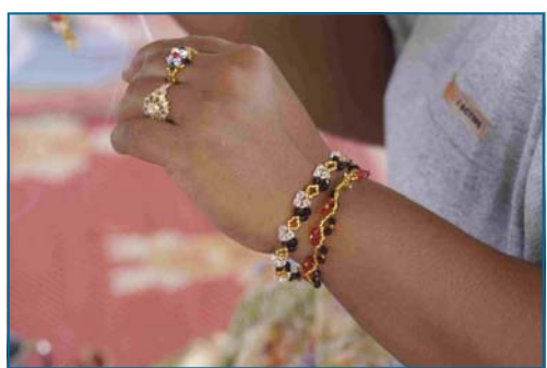
Local bead jewelry products...

Over the past two months a group from village 4, Ta Klang have begun to produce and sell bead jewelry. The group of nine women received a small grant from