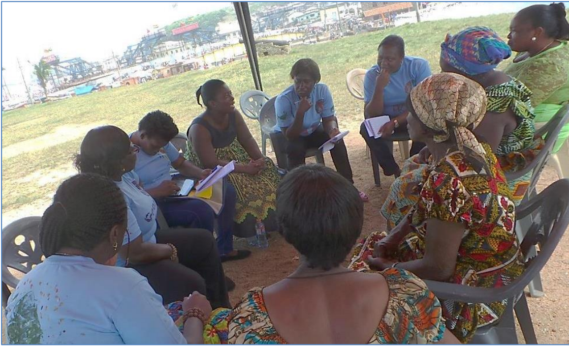
Figure 3. Stakeholder meetings in Elmina