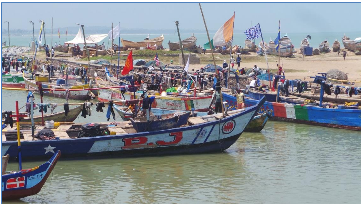
Figure 4. Elmina Port was the site of the course field activities.

A training room set up for PowerPoint presentations and group interactive activities is necessary. Access to nearby fishing ports is also necessary.