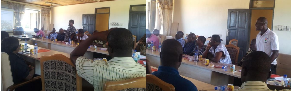
Figure 5 Members of W/R FWG sharing experiences with participants

companies, and currently some fishermen have been employed to serve in the capacity as fisheries liaison officers', he concluded.