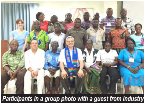
Participants in a group photo with a guest from industry

season. The tour was jointly organized by USAID/Ghana SFMP and the World Bank's West African Regional Fisheries Program.