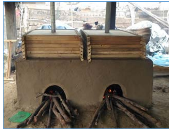
Figure 2 The improved Morrison stove adds a number of energy efficient features

The smoking and drying techniques of the Chorkor stove have limitations that deserve greater attention in order to significantly improve livelihoods of small-scale fishers and respond effectively to product safety challenges – especially linked to controlling contamination by polycyclic aromatic hydrocarbons (PAH), a public health hazard. PAH are carcinogenic, fat soluble, nonvolatile and extremely persistent, and develop especially during the incomplete combustion of organic materials. Globally, PAH levels in food are monitored by regulatory agencies with a combination of four compounds (PAH4) being of specific interest: benz[a]anthracene, chrysene, benzo[b]fluorantene and benzo[a]pyrene. Under EU food standards, the level of PAH4 in smoked food products should not exceed 12 \mu\text{g}/\text{kg} and for benzo[a]pyrene (BaP) 2 \mu\text{g}/\text{kg} .