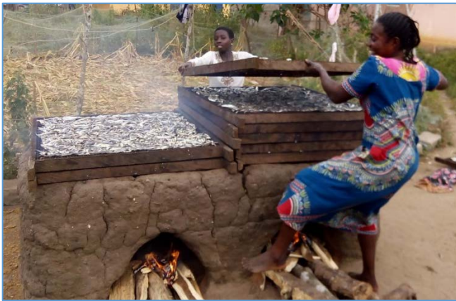
Figure 1 A Chorkor Stove in use. The same basic design is now used throughout West Africa