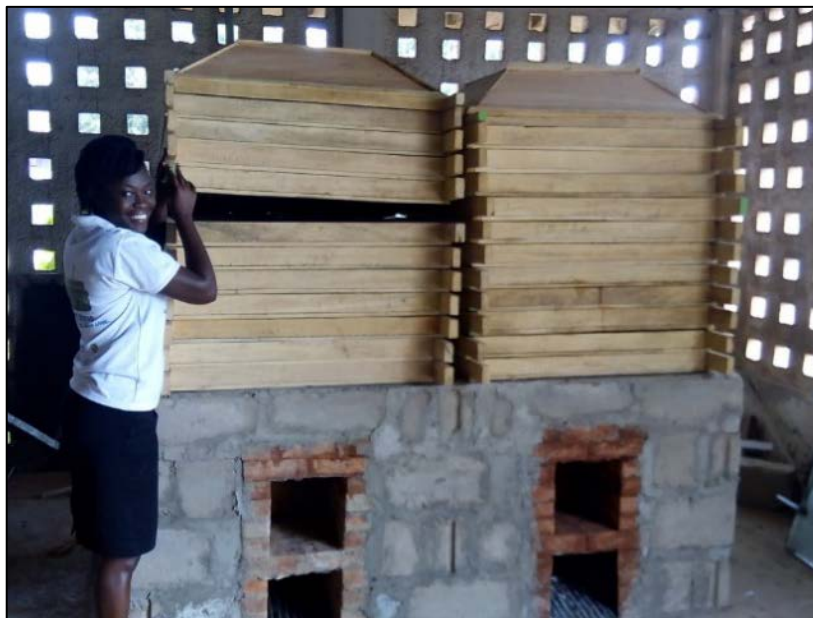
Figure 4 A double-unit Ahotor stove, offering lower-PAH levels and an improved energy efficiency

The Ahotor or Comfort stove (Figure 4) is comprised of this combustion chamber fitted centrally to a Chorkor or Morrison-like outer shell, with fish processing trays above as in normal operation. It can be either a retrofit or a new-build, with the latter made from sandcrete blocks and cement, and also as a single or double unit. Above the combustion chamber, a fat collecting tray is fitted that allows the hot gases to flow up through to the fish while preventing any fat from falling down onto the fire. A PAH analysis showed that the Ahotor stove (Figure 4) achieved 6\ \mu\text{g}/\text{kg} and 53\ \mu\text{g}/\text{kg} for BaP and PAH4 respectively, considerably lower than the Chorkor (Figure 3). In addition the stove was 32% more fuel efficient than the Chorkor.