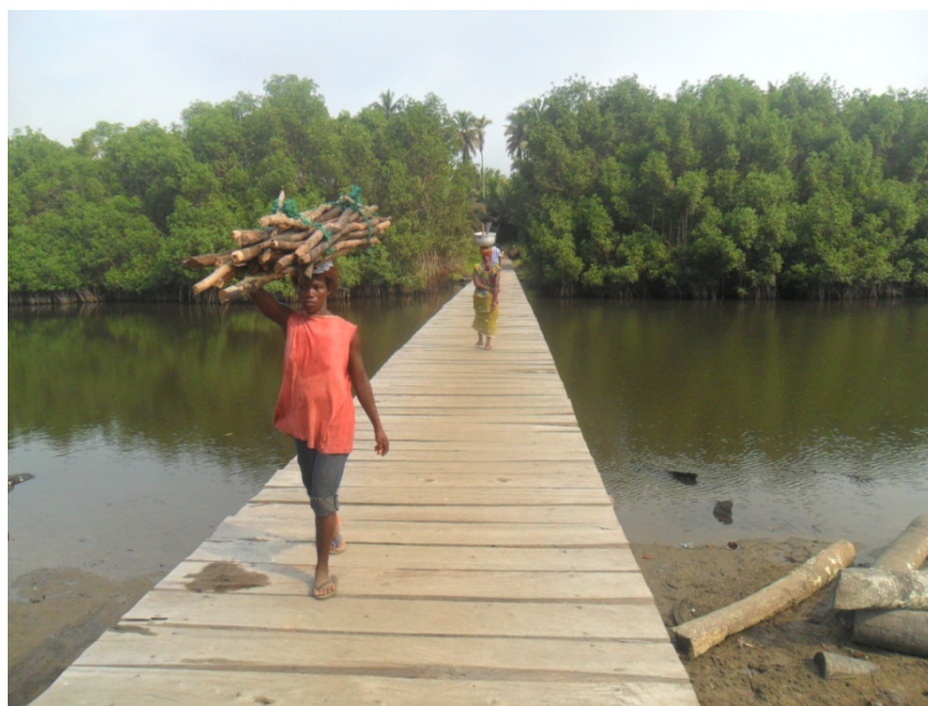
Figure 10: Women crossing Domunli lagoon

Even though wetlands in the Amanzule area are regarded as the property of all, women are at certain times restricted from having access to resources of the wetland or denied access for traditional reasons. Women in their period of menstruation are forbidden to draw water from a river/stream or even cross a wetland (lagoon). In situations where a woman happen to experience her menstruation whiles in the bush/farm or perhaps have already crosses the lagoon, she must return with a leaf in her mouth and not greet anyone on her way back home. By tradition, anyone who sees such woman understands her condition and would not greet or attempts to engage her in some pleasantries. Similarly, women who did not pass through three conservative periods of menstruation (locally referred to as Armoo in Nzema ) are not allowed to also go near wetlands and in some parts of Nzema, such women are not even allowed to stay in the community.