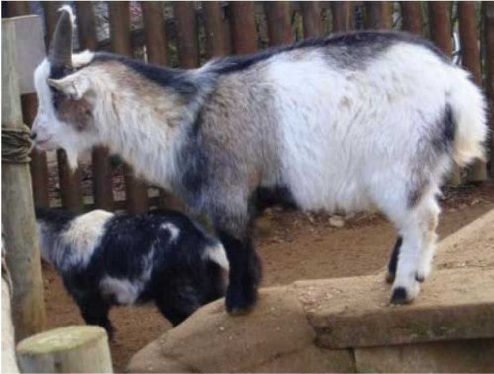
Figure 11: A Goat

By traditional beliefs and certain rituals performed in the olden days to ensure the prosperity and continuous existence of some communities in the study area, certain animals mostly used in such ritual are not reared in the communities.