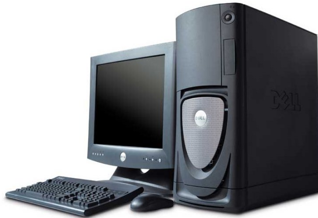
Figure 14: Computer

Moreover, due to the influence of formal education and modernization, many people have neglected the customs that hitherto was the backbone of the sustainability of the environment. Similarly the advances in technology and its adoption by most people have led to less respect for customary laws. There is no gainsaying that these factors among several others would continue to impact negatively on customs and traditions that protected wetlands in our society.