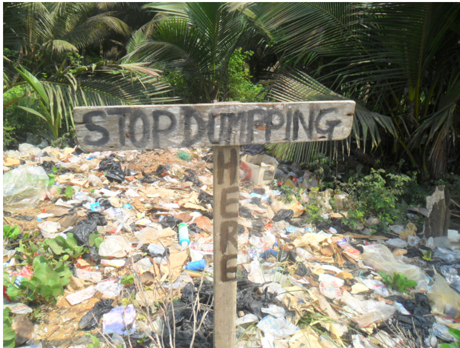
Figure 9: Refuse dumped at Upper portion of Edinla lagoon in Ezinlibo

Again, in recent times, some communities have dumped refuse close to the banks of lagoons. This was just not the case in the olden days as people really regarded the place as the abode of the gods and showed their total respect for fear of being strike dead by the gods.