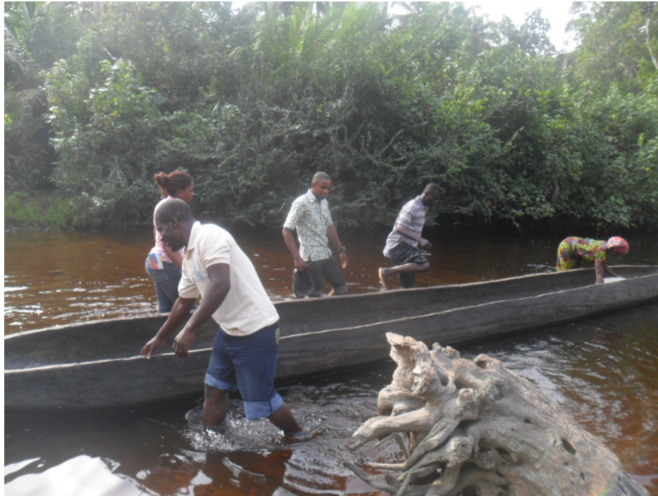
Figure 4: The Research team on their way to Old Bakanta

Table 1 below denotes specific communities visited and the wetland in each community.