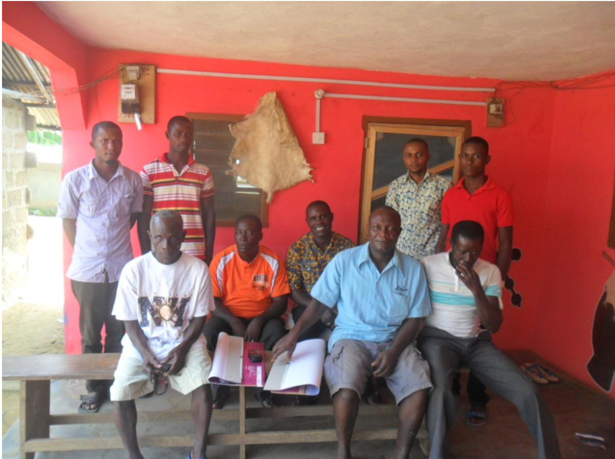
Figure 1: Chiefs of Nzulezo & Elenda with the research team

The research team deeply appreciates the support, time and inputs by traditional rulers, traditionalists, family heads, opinion leaders and all others that made the community information gathering a success. Special appreciations go to the Chiefs of Nzulezu, Bobrama and Elenda as well the royal family heads of Beyin, Azulenoanu, New Nzulezu and Ellonyi for their great inputs.