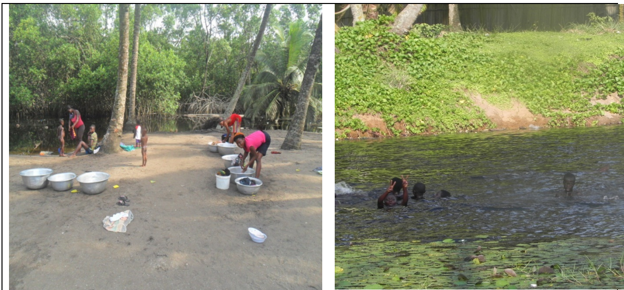
Left: Women washing clothes at Ekpupole lagoon at Metika

Indeed, the historic and present uses / benefits of wetlands have not seen significant changes. Most wetlands in the focal area are inundated with mangroves and also serve as crocodile habitat. As such people since time immemorial have not considered such areas for farming activities. In almost all the communities visited, lagoons/ streams are used for varied purposes such as serving as sources of food-fish; source of wood, source of water for bathing, drinking, washing and household chores.