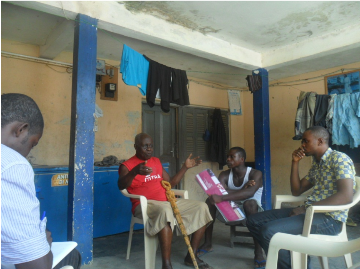
Figure 2: Interview with Royal family head of Azulenoanu

The study, conducted between January 28 and February 3, 2013, covered 12 and 10 communities in the Jomoro and Ellebelle districts respectively. These 22 communities were selected based on their proximity to a wetland. They were, in the Jomoro District: New Town (Avolenu), Effasu, Metika, Half Assini, Ekpu, Egbazo, Old Kablensuazo, Ezinlibo, Ellonyi, Ebonloa, Nzulezu 4 (Old and New) and Beyin. The rest in the Ellebelle District were: Old Bakanta, New Bakanta, Azulenonu, Ampain, Sawoma (Ankobra), Bobrama, Kikam, Alabokazu, Asemdasuazu and Alloekpoke.