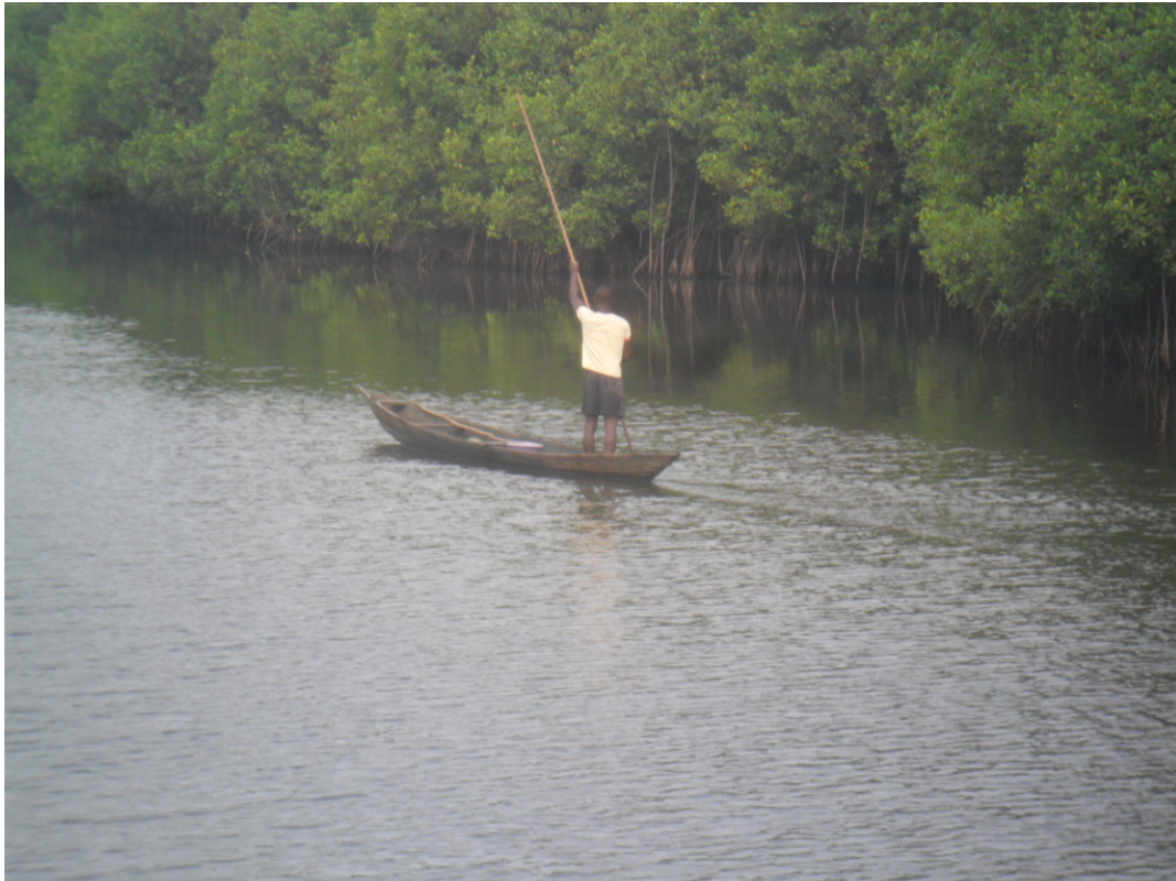
Figure 7: A man fishing in the Domunli lagoon

Indeed, the historic and present uses / benefits of wetlands have not seen significant changes. Most wetlands in the focal area are inundated with mangroves and also serve as crocodile habitat. As such people since time immemorial have not considered such areas for farming activities. In almost all the communities visited, lagoons/ streams are used for varied purposes such as serving as sources of food-fish; source of wood, source of water for bathing, drinking, washing and household chores.