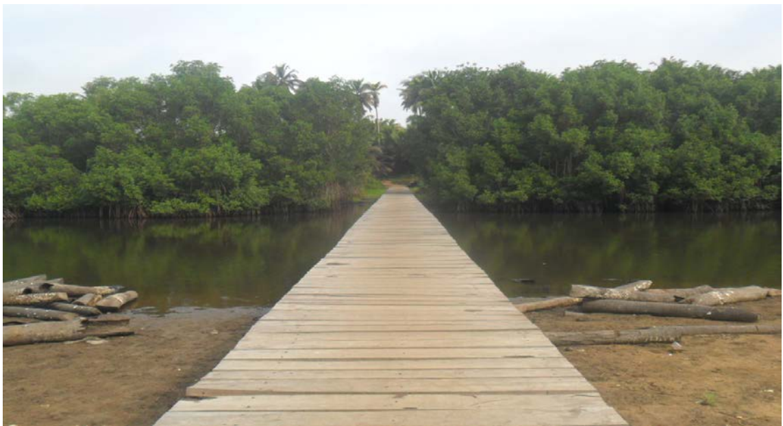
Table 5: Showing reverence to wetland gods