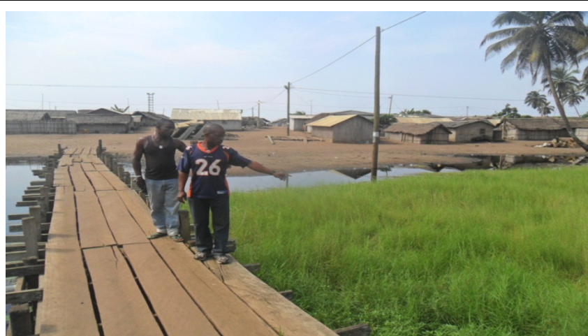
Table 3: Community decision to stop cutting mangroves

In the picture, the area being pointed by the community members were once full of mangroves. However, in an attempt to expand the lagoon, the people of Metika decided to cut all the mangroves in that portion to make way for more water. This was also to increase their swimming space/area but this action rather resulted