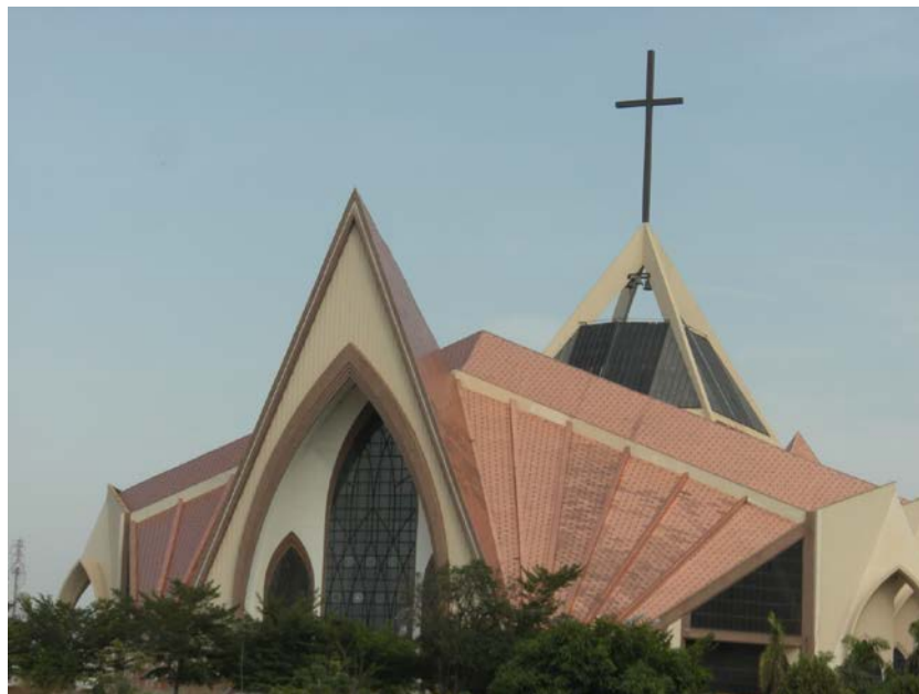
Figure 15: A Church

Moreover, due to the influence of formal education and modernization, many people have neglected the customs that hitherto was the backbone of the sustainability of the environment. Similarly the advances in technology and its adoption by most people have led to less respect for customary laws. There is no gainsaying that these factors among several others would continue to impact negatively on customs and traditions that protected wetlands in our society.