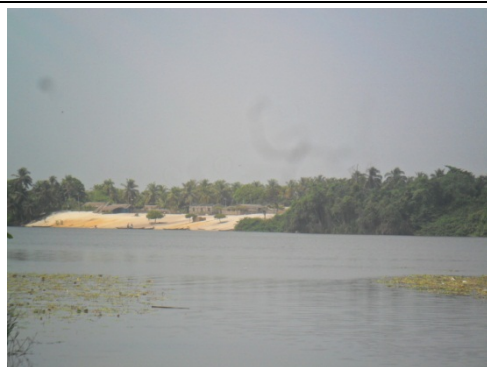
Table 4: Footballers & Balibangara lagoon

Footballers in New Town had a belief that worked for many years that the Balibangara lagoon (shown left) was capable of helping them to win football games on two conditions. That the match is played in their community and that they are able to whiles playing the match, let the ball enter the lagoon. As such, when it came to playing football matches with other