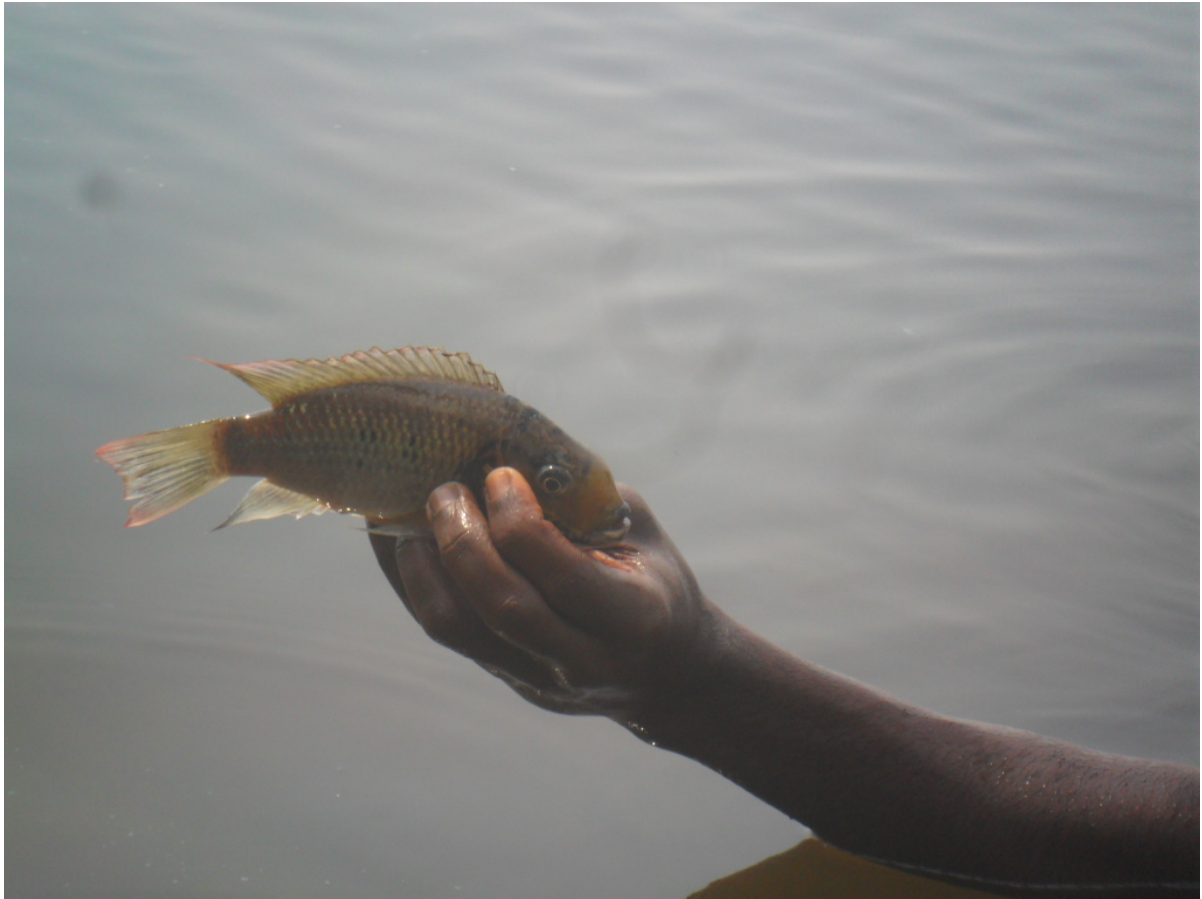
Figure 3: Local fishermen displaying fish