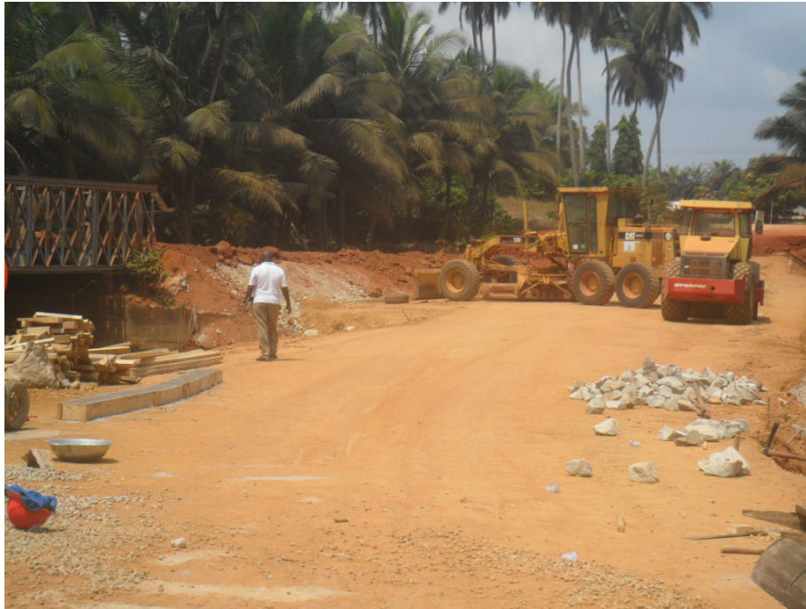
Figure 13: A new bridge under construction over Ellonu lagoon

Indeed, such rituals, as pointed out by community elders were very important and strictly adhered to. At Azulenoanu, it was indicated by a family head that “the community at some point in time stopped performing the necessary rituals and this resulted in the gods killing most community members. However, upon advice from the Chief priest, we started performing the rites and the killings stopped and in return the community received blessing and protection from the gods” .