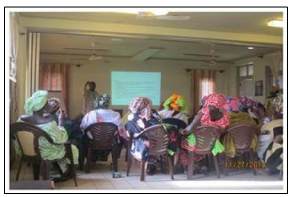
Figure 8: Participants in Code of Conduct workshop

The workshop was attended by 20 women. A series of rules were adopted following the presentation of group work. These rules will be transcribed in a document in the form of a code and presented at a validation workshop. To ensure its ownership by the women, it is planned to translate it into Wolof (local language) and to include it in functional literacy programs.