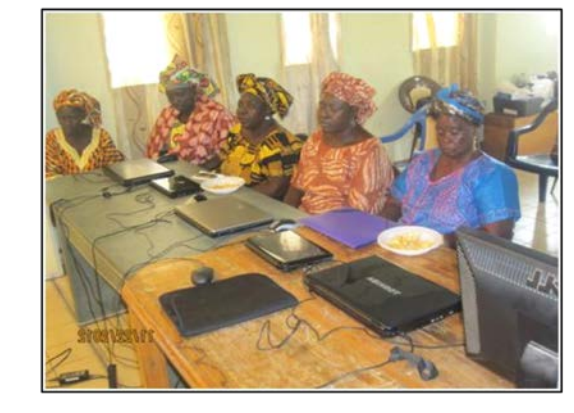
Figure 7: Women participating at IT training

IT training: Information technology is an important tool that can enhance the delivery of services for women in the processing industry. It contributes to the education of women, alongside literacy programs. Good computer skills will allow the women to obtain real time information on markets, design marketing strategies, and store production data in a reliable manner. In this session, 10 women acquired basic skills in Microsoft Office Word.