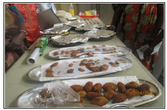
Figure 9: Exposition of fish products

Information and awareness day about the local brand, Keccax from Cayar: The process toward product branding has already begun with the training session on hygiene, quality, and the standardization of practices. A code of conduct will then be drafted. All of these activities are prerequisites for branding. During functional literacy classes, the women familiarized themselves with the notion of branding without unraveling its content. Therefore, rather than a training session on branding, it was deemed preferable to initially organize an information and awareness event on the local brand. Based on the results of the workshop, a purely technical training session with qualified consultants will be organized.